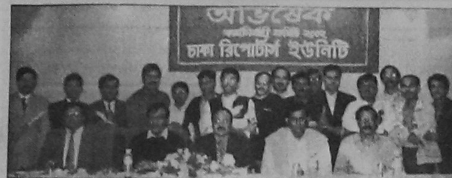
The newly-elected office-bearers of the Dhaka Reporters Unity (DRU) at its installation ceremony at the National Press Club in the city yesterday.