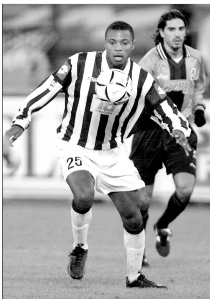
Marcelo Zalayeta (L), Juventus' Uruguayan international, taking control of the ball during the Italian Cup quarterfinal against Atalanta at Turin on January 9.

Di Vaio - with 12 goals the Italian First Division's joint top scorer - was denied by a fine save from Udinese goalkeeper Morgan De Sanctis.