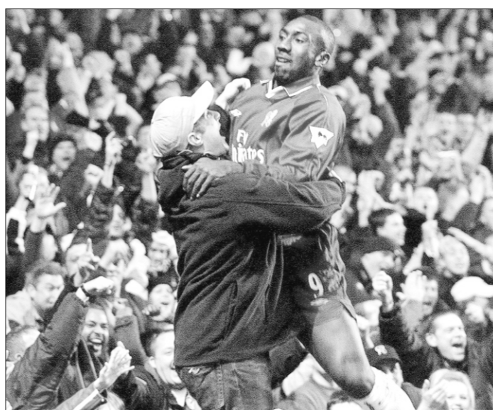
Chelsea's prolific Dutchman Jimmy Floyd Hasselbaink (R), exults with a fan after scoring against Tottenham Hotspurs in their English League Cup semi-final first leg match at Stamford Bridge on January 9.