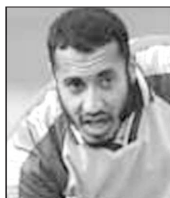
AL SAADI KADHAFI

"Our actual stake is only a starting point and eventually we would like a 20 percent share in the club - Juve needs the extra investment and we believe we have made an