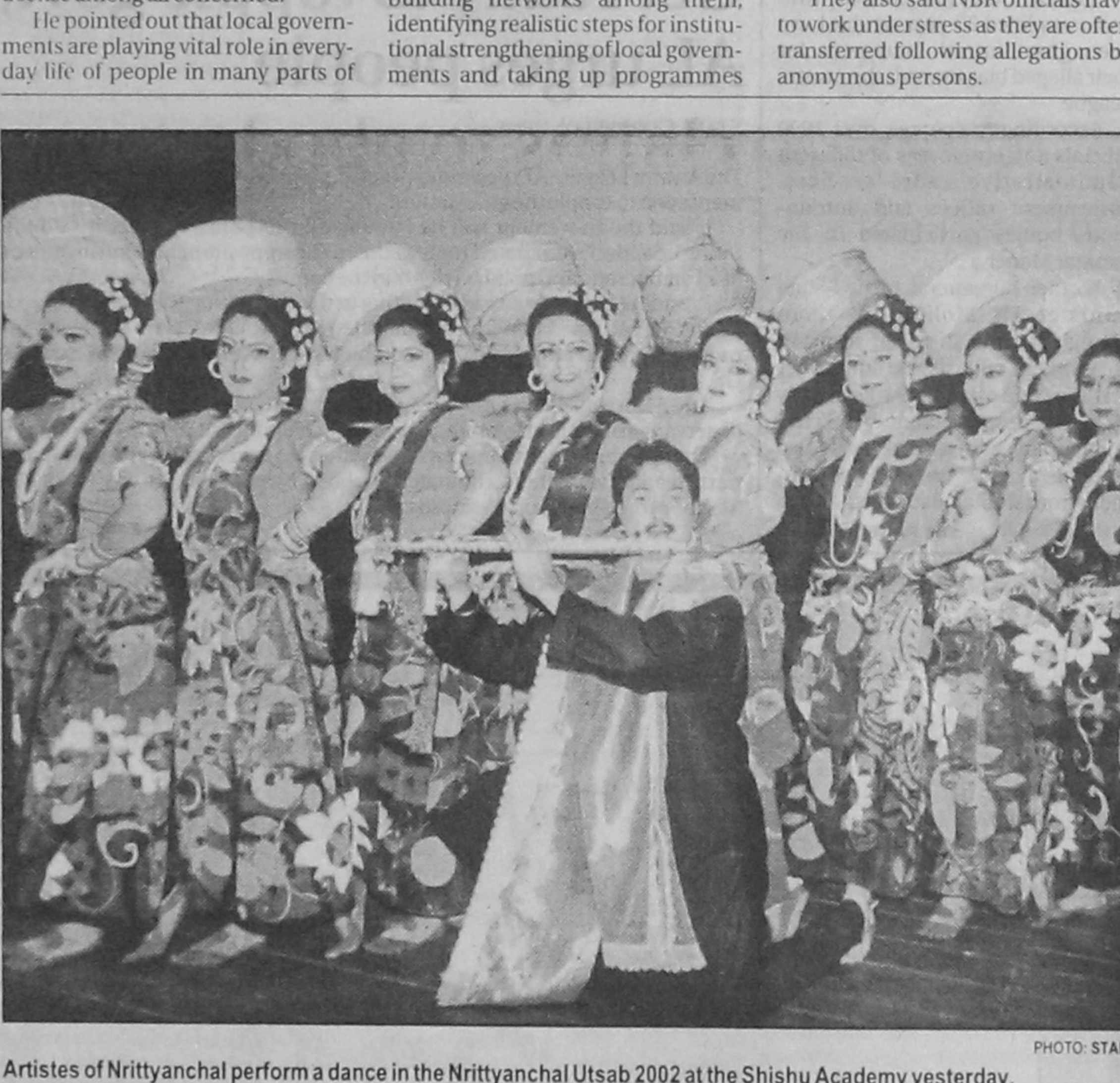
Artists of Nrityanchal perform a dance in the Nrityanchal Utsab 2002 at the Shishu Academy yesterday.