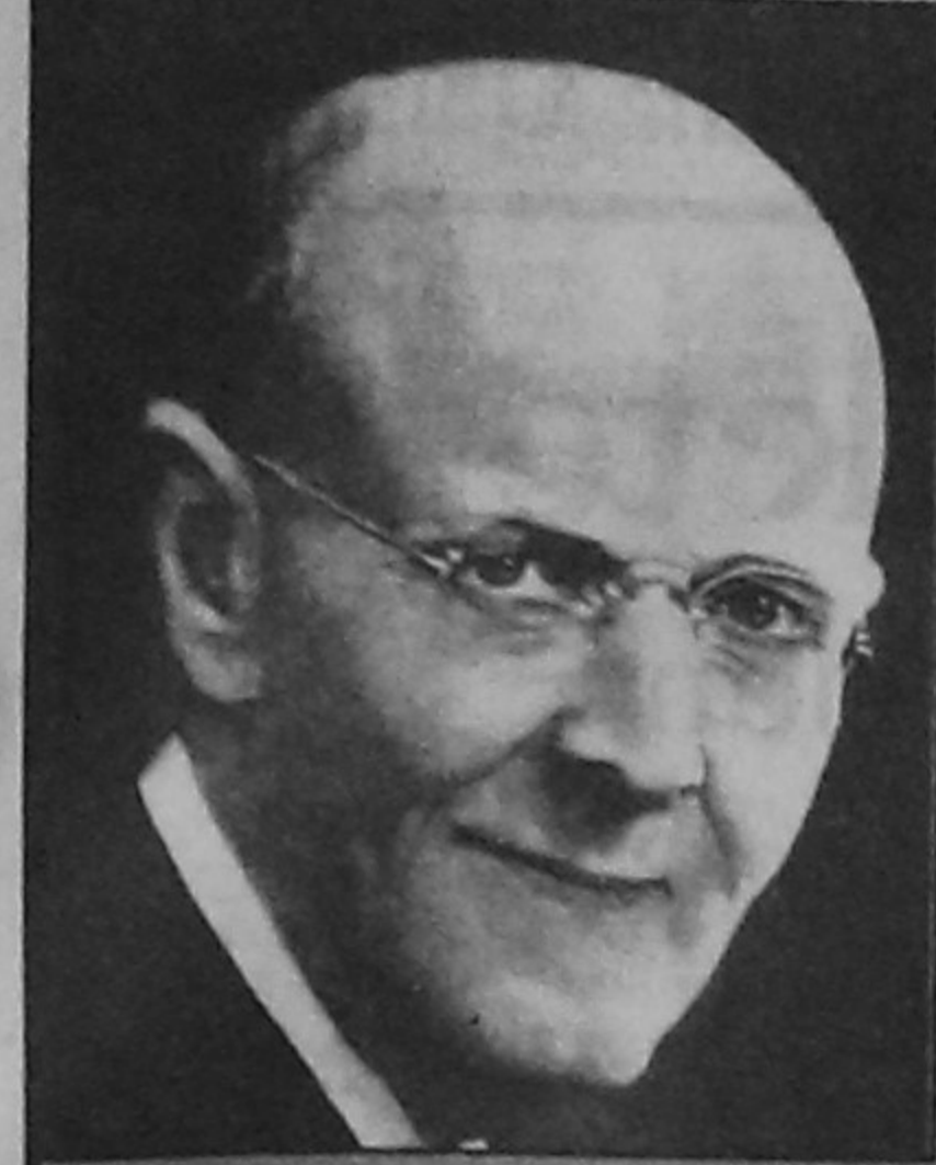
Paul P. Harris Founder of Rotary