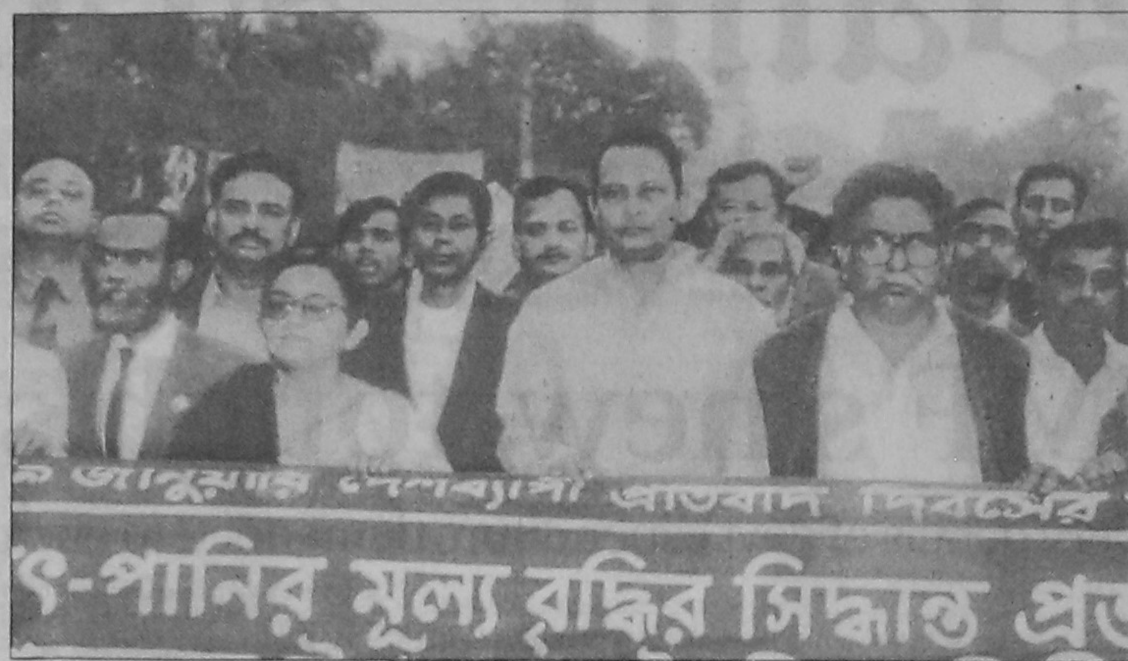
JSD staged a demonstration in the city yesterday demanding withdrawal of price hike of fuel oil, gas, water and electricity.

The CFC will also arrange a study circle at its office in the port city every month.