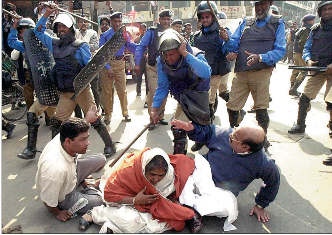
Police club former home minister Mohammad Nasim (right -- on the ground) and former agriculture minister Motia Chowdhury (middle) during the hartal hours in the city yesterday.