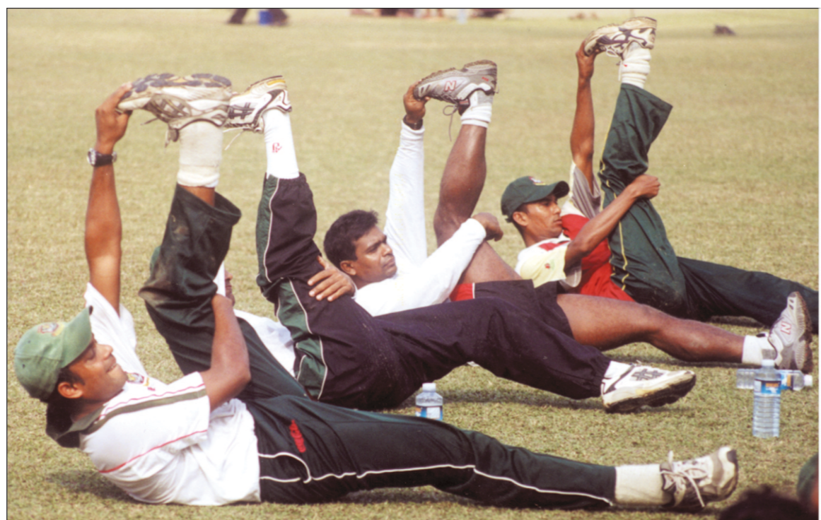
GETTING READY: Bangladesh (L) and Pakistan players stretch as part of their practice ahead of the first Test, which starts today, at the Bangabandhu National Stadium on Tuesday.