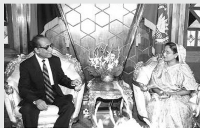
The blame game

The people are not enamoured with the 4-party alliance, but they were definitely fed up with the previous government for publicly and shamelessly supporting known terrorists. The people have no illusion about the 4-party alliance and its capability, but