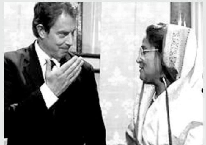
"So what about the Talibans...?"