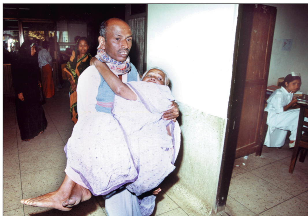
An attendant carries his sick mother to a far away ward at the Dhaka Medical College Hospital yesterday in the absence of trolleys. Allegations are there that a section of the employees of the hospital rent the trolleys while the authorities close their eyes to the sufferings.