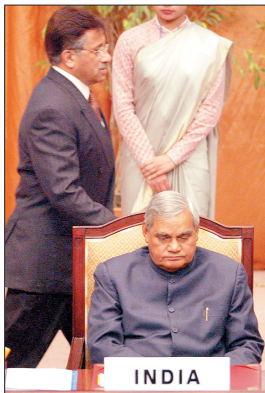
Indian Prime Minister Atal Bihari Vajpayee looks down at Pakistani President Pervez Musharraf walks by after taking the stand at the end of the 11th SAARC Summit yesterday.