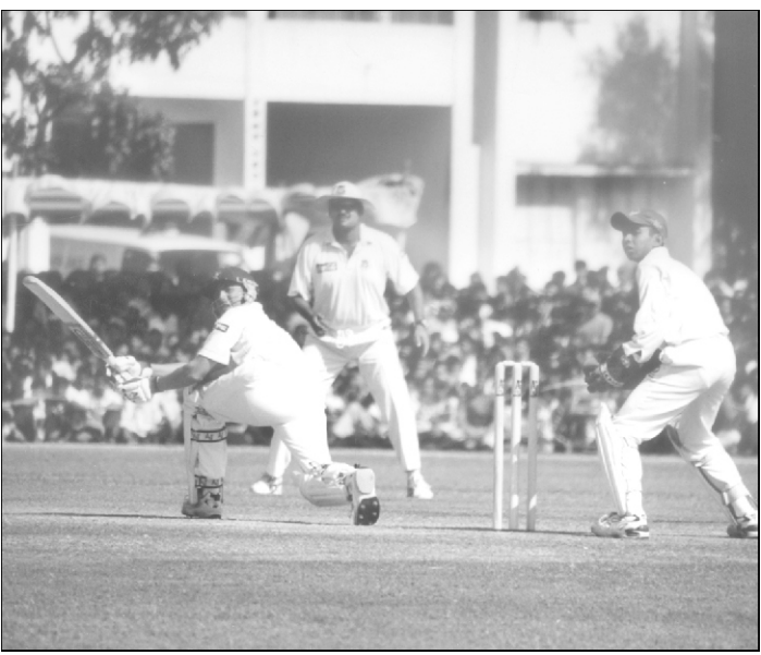
Pakistan's Younis Khan sweeps on way to scoring a strokefilled 112 before retiring hurt on Saturday.

innings only to complete his hundred. The Lahore-based right-hander laced his innings with 11 fours off 115 balls. "Our batsmen played well in the match," Pakistan skipper Waqar Younis told reporters. "We declared our innings at 312 for three after tea to allow Bangladesh A to bat in a bid to finish their innings as early as possible." However, a team looked focussed not to lose any wicket with fast bowlers Waqar Younis and Shoaib Akhter operating with full