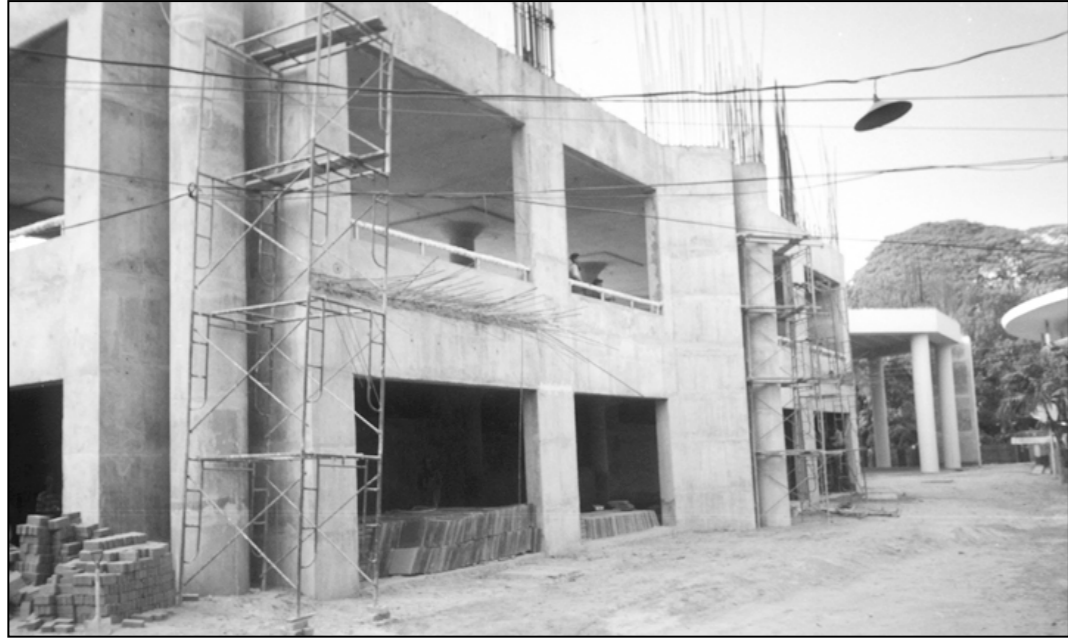
The planned 8-floor 'Chitrahshala' in the premises of Bangladesh Shilpakala Academy

Nityanchal, a front ranking organisation in the country to institutionalise dance as a popular form of art, is organising a five-day long dance festival from January 10 to 14 at Bangladesh Shishu Academy Auditorium.