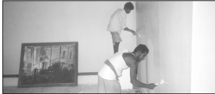
Two painters renovate an interior wall of Osmany Memorial Hall

Round the edges of the heap of eggs are found some remnants of red earth ready to be sprinkled with water. Through creation of this particular portion of the form, the artist wants to exhibit the dominant contribution provided by water in Bangladesh. At this particular stage, the artist brings together a symbolic closeness between Dhaka and New York. Nagasawa's goal crosses the limit of geographical and social boundary to create a bond of close relationship among communities