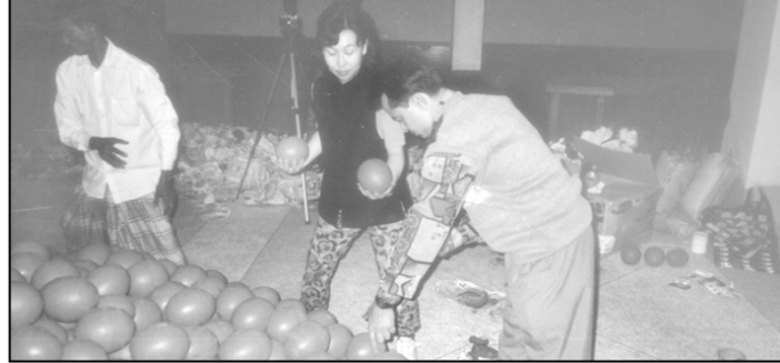
An art commissioner from Japan helps a staff of Bangladesh Shilpakala Academy in installation work

'The terra-cotta eggs, numbering up to 5,000, symbolize the nature of