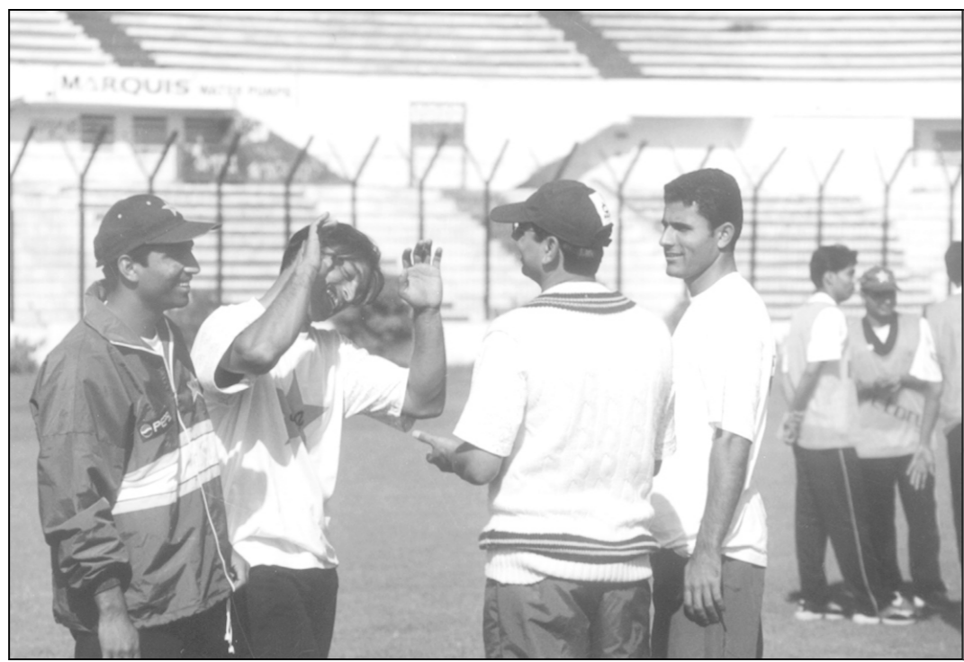
TAKING A BREAK FROM CRICKET! (L) Pakistanis (L-R) Yousuf Youhana, Shoaib Akhtar, Saqlain Mushtaq and Abdur Razzaq share a light moment while (R) Rashid Latif discharges (!) the duties of a photojournalist during their practice session at the Bangabandhu National Stadium on Thursday.

UNB, Dhaka Fire Service and Civil Defense reached the semifinals of the Premier Division Kabadi League beating Sonali Bank 91-54 at the court adjacent to the Maulana Bhasani Hockey Stadium on Thursday. The winners dominated the first half 40-31.