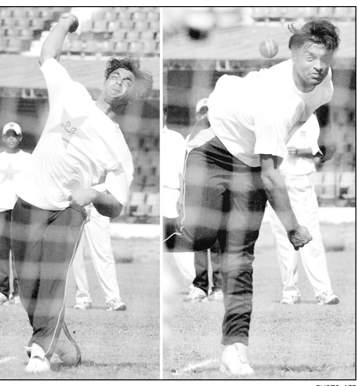
AKHTAR'S ACTION: A combo picture taken from different angles shows Pakistani speedster Shoaib Akhtar bowl during the practice session on Thursday.