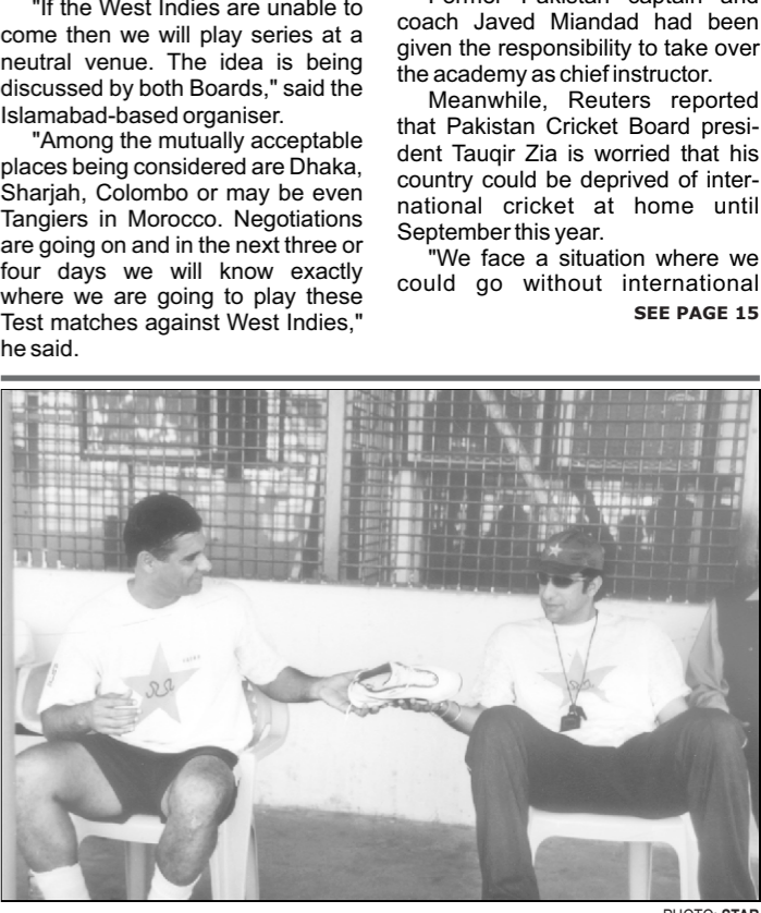
TRY THIS: Pakistan fast bowler Wasim Akram (R) shows his new practice shoe to captain Waqar Younis during a break from practice yesterday.