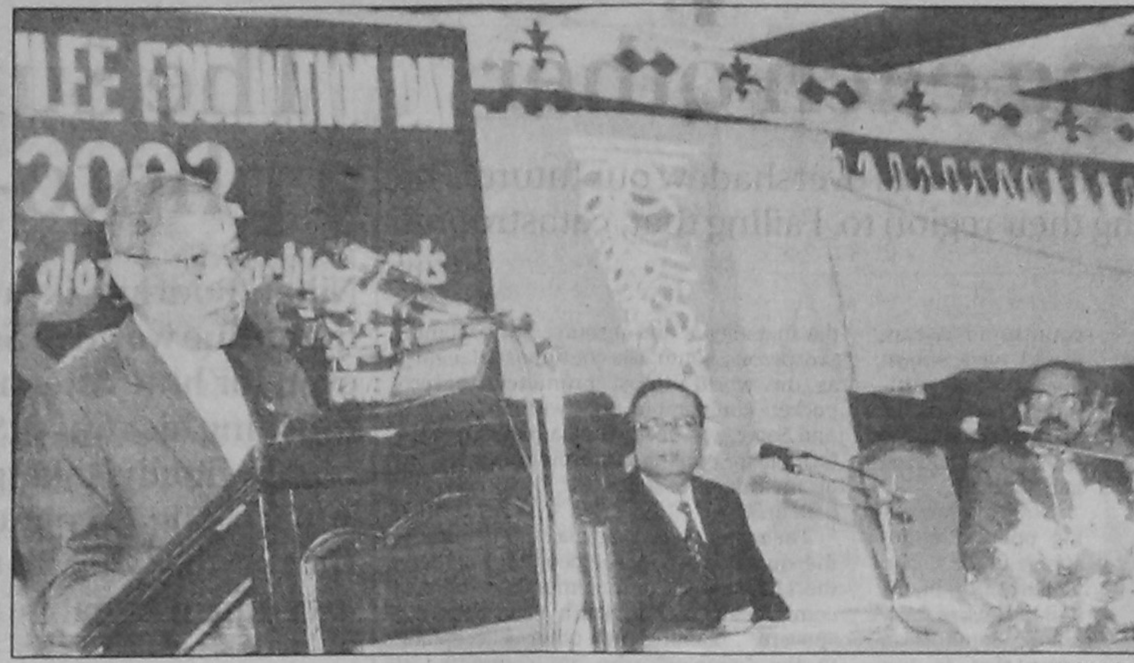
President AQM Badruddoza Chowdhury addressing the inaugural ceremony of the golden jubilee celebrations of the Asiatic Society of Bangladesh in the city yesterday.