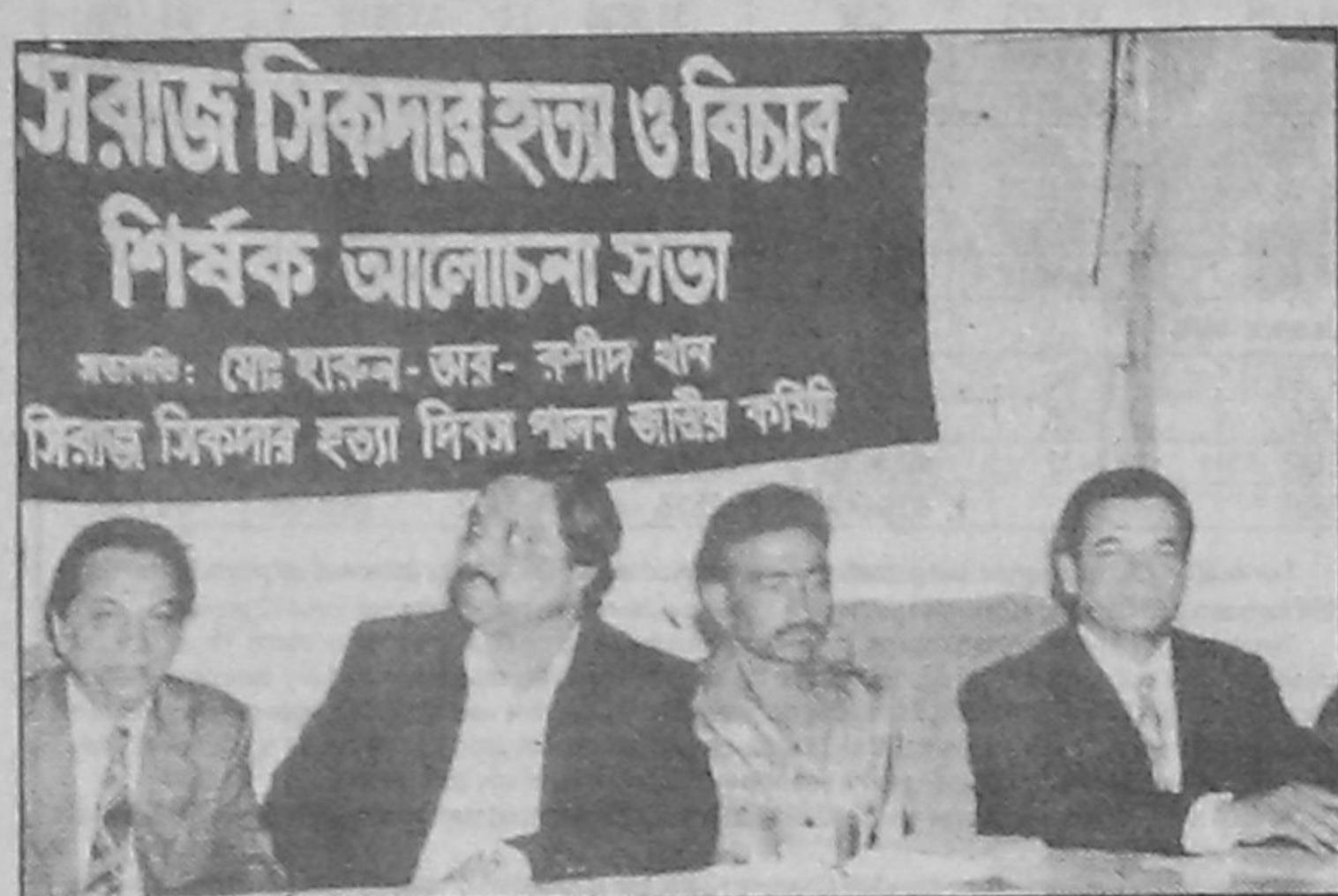
The national committee for observing Sirajud Daulat killing day organised a discussion yesterday at the Photo Journalists Association auditorium in the city.