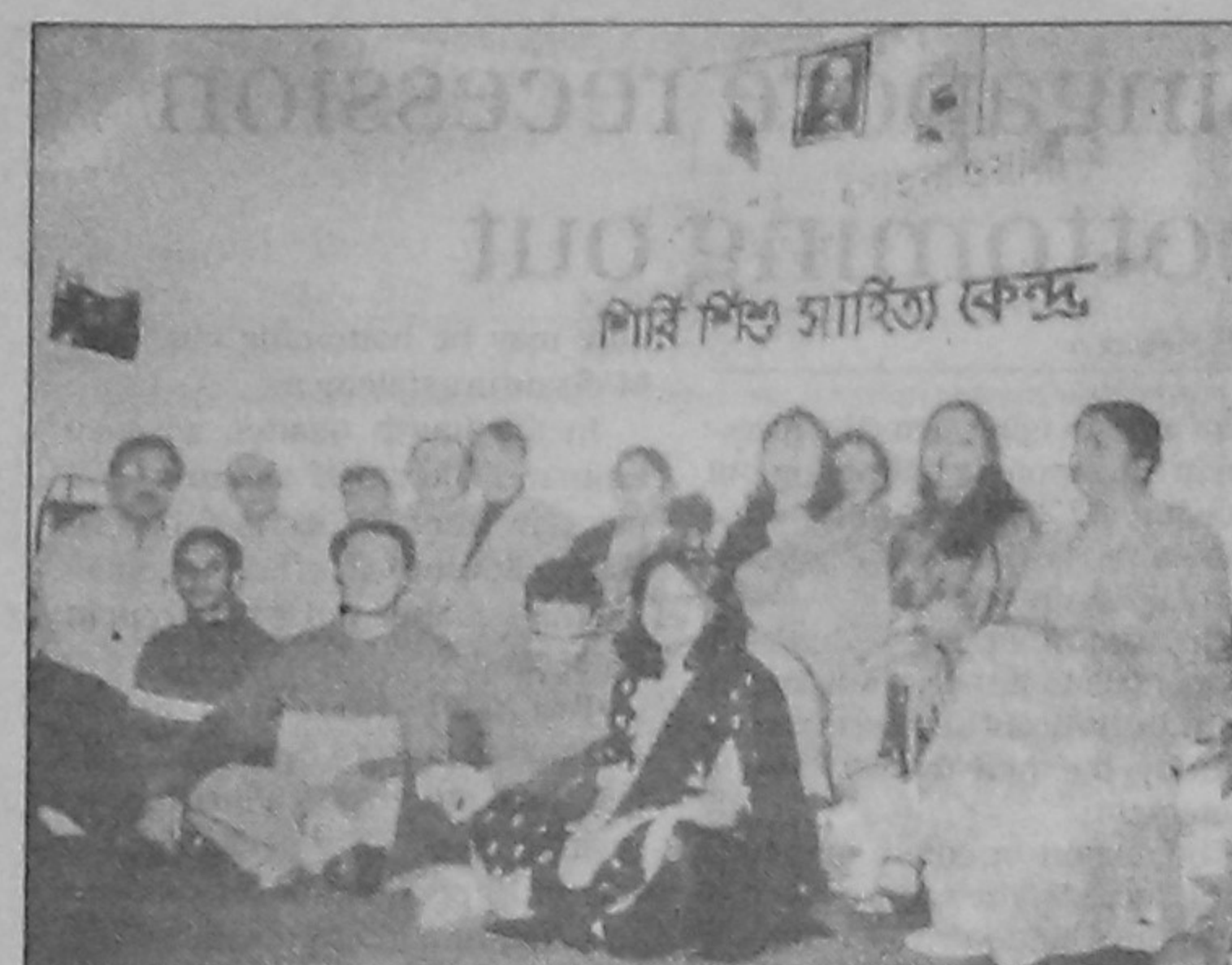
Shri Shishu Sahitya Kendra organised a memorial gathering on Husein Shaheed Suhrawardy in New York recently.