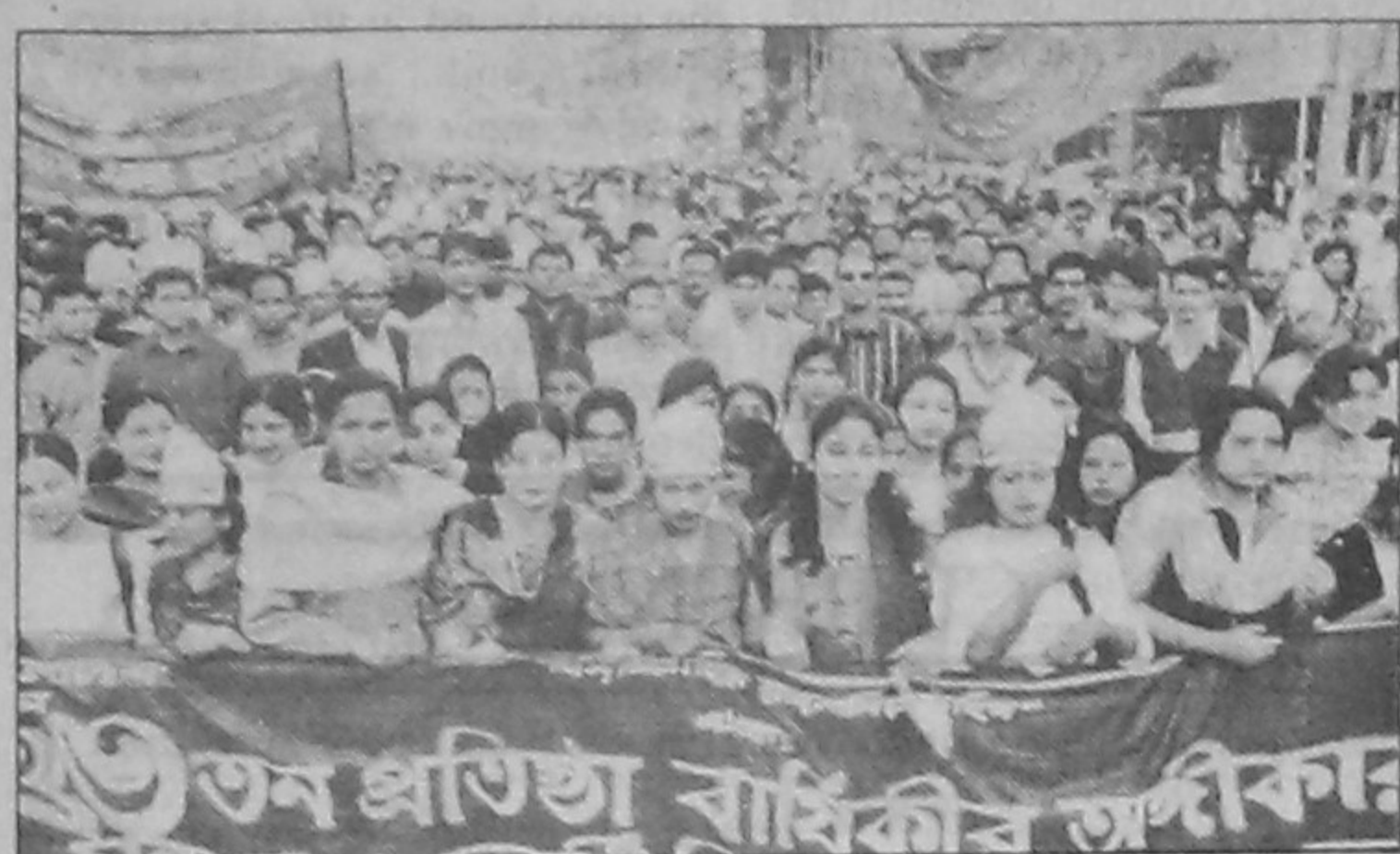
On the occasion of the 23rd founding anniversary of Jatiyatabadi Chhatra Dal its city unit brought out a procession in the capital yesterday.