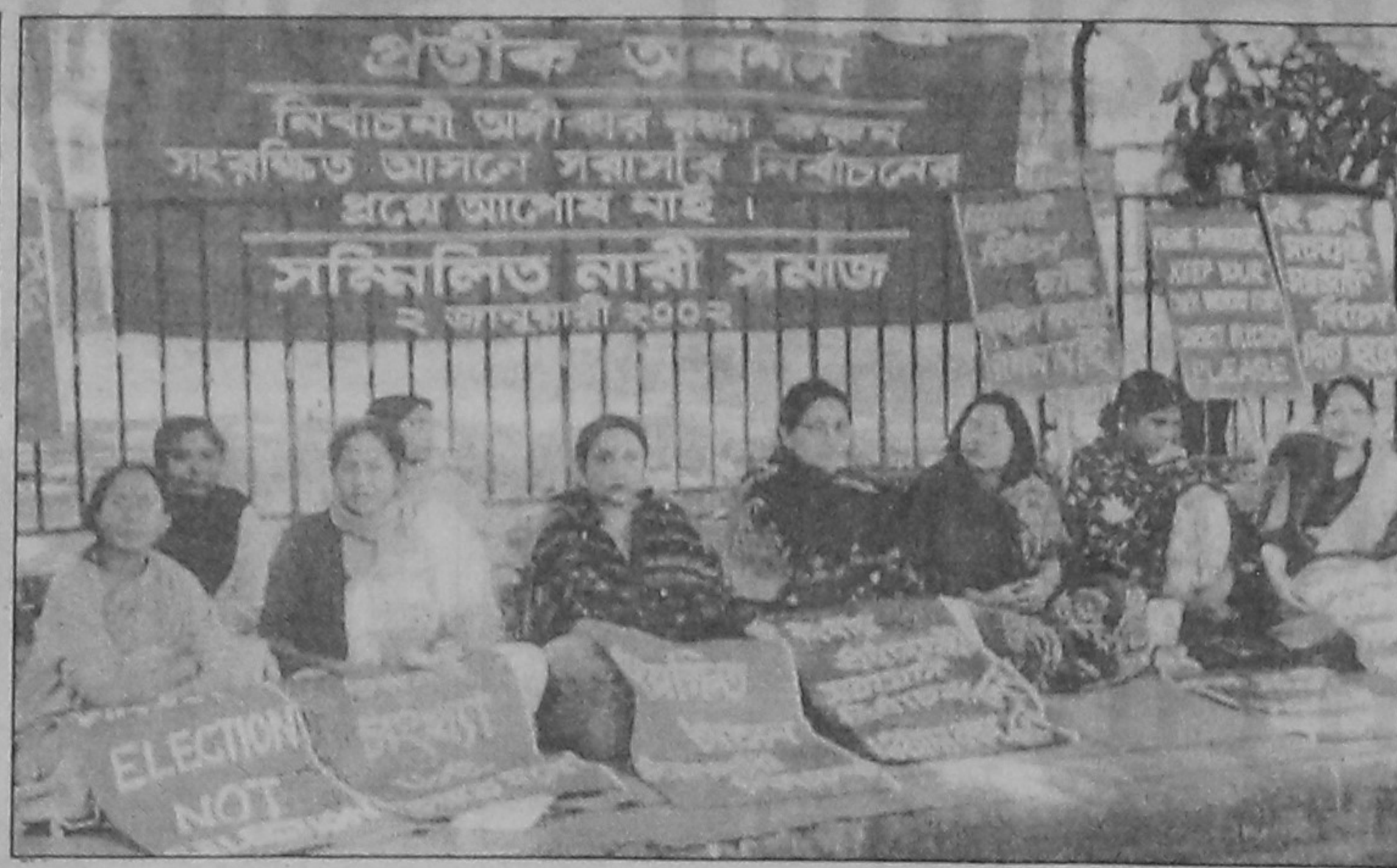
The Sammito Nari Samaj observed a token hunger strike in front of the National Press Club yesterday demanding direct election to women reserve seats in parliament.