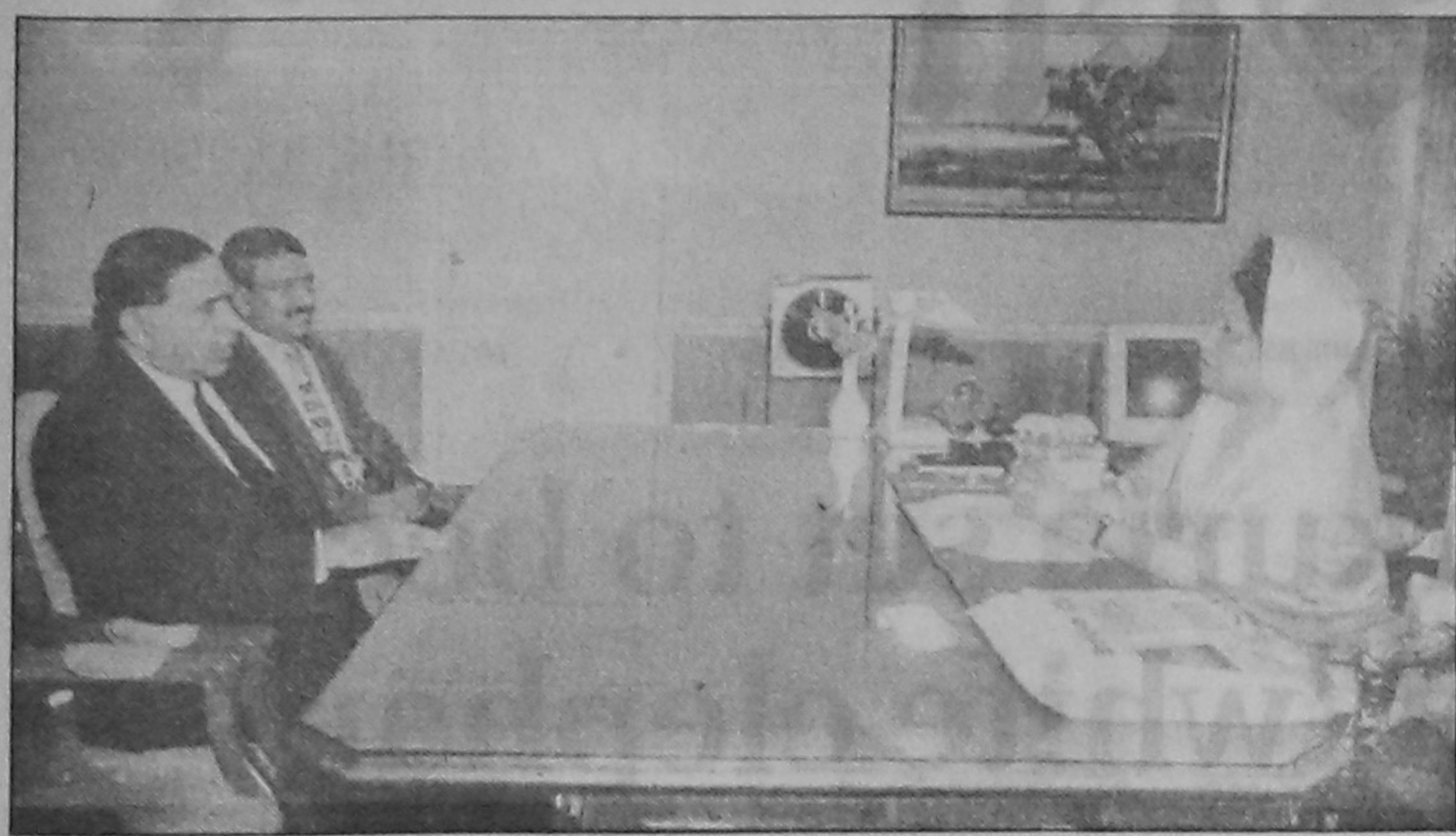
PHOTO: PJO Gano Forum President Dr Kamal Hossain called on Prime Minister Khaleda Zia at her office in the city yesterday.