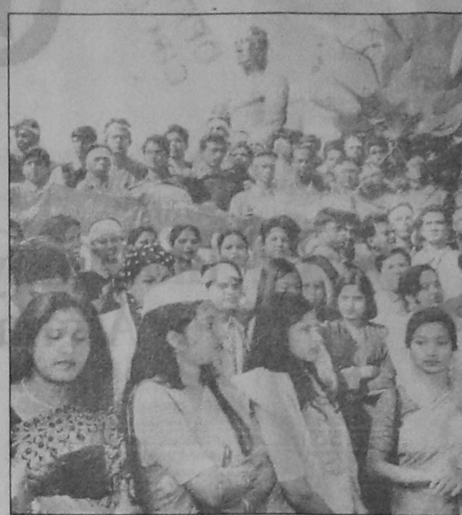
Jatiyatabadi Chhatra Dal held a rally on the Dhaka University campus yesterday on the occasion of its founding anniversary.