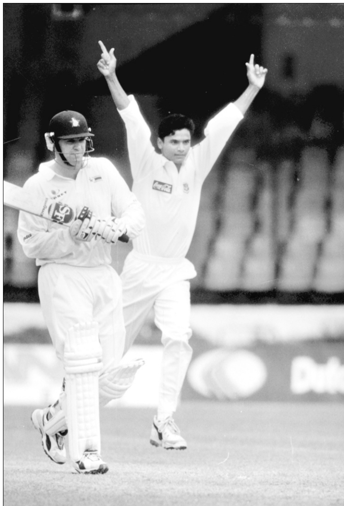
MASHRAFEE-BIN-MORTUZA ... the fastest Bangladeshi gun

Just like in life there is no final word or chapter that can perfectly sum up a course of an event or happening. The best thing we can do as the curtain falls is perhaps make a renewed pledge to reach a certain goal in the days and months ahead. Farewell 2001! Welcome 2002!