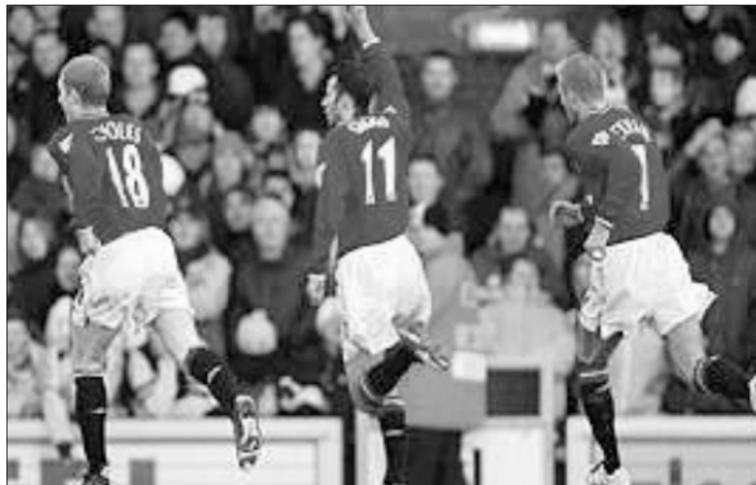
Manchester United ace Ryan Giggs (C), celebrates the match-winning strike against Fulham at Craven Cottage while teammates Paul Scholes (L) and David Beckham joins in on December 30.

Just seconds after Fulham striker Louis Saha had rattled the crossbar, a goalkeeping error by home goalkeeper Edwin van der Saargifted United an early lead.