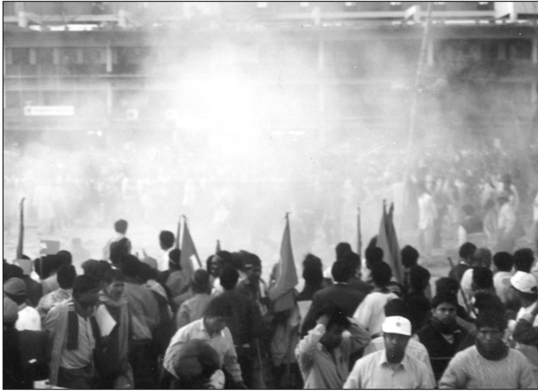
January: Bomb blast in CPB rally at Paltan Maidan in Dhaka on the 20th killed five.