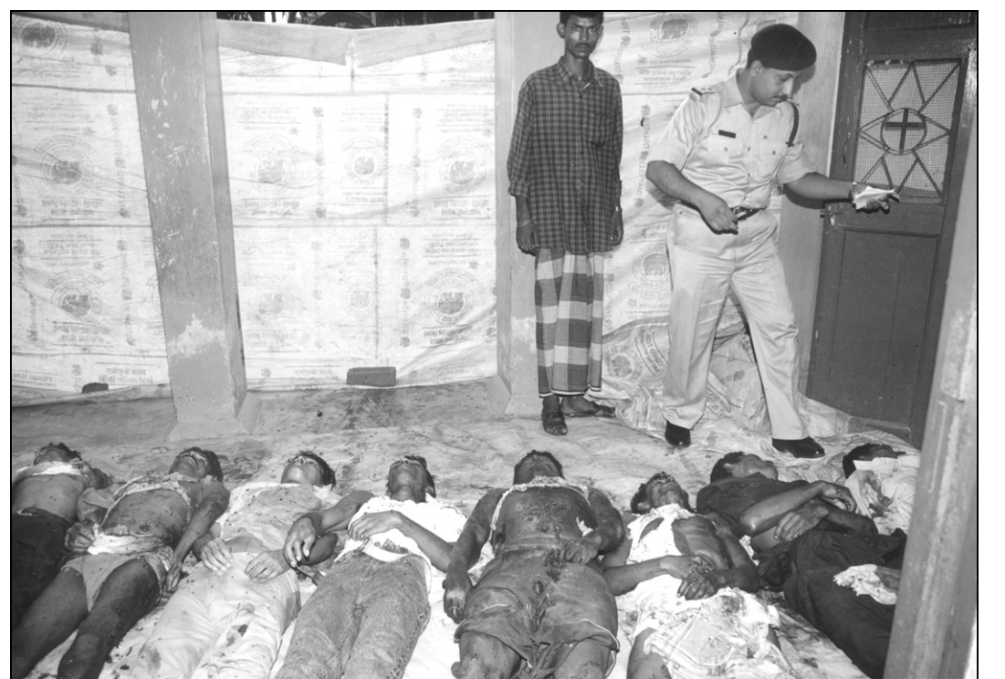
June: Bomb blast at Baniarchar church in Faridpur on the 3rd killed 20.