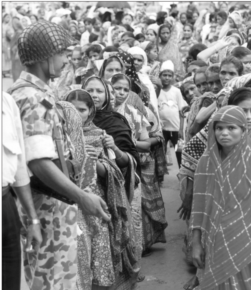
October: National elections peacefully held on the 1st.