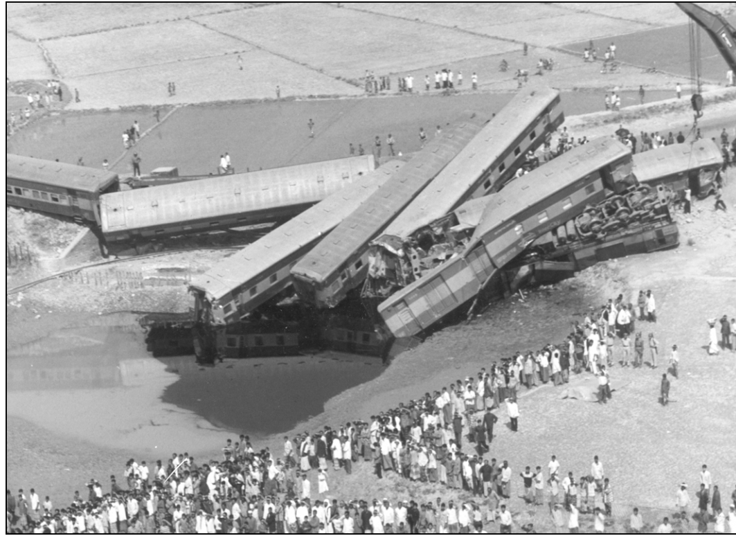
February: A major train accident near Gunabati station on Dhaka-Chittagong route on the 7th although killed a few and injured a couple of scores of passengers, the loss ran to crores of taka.