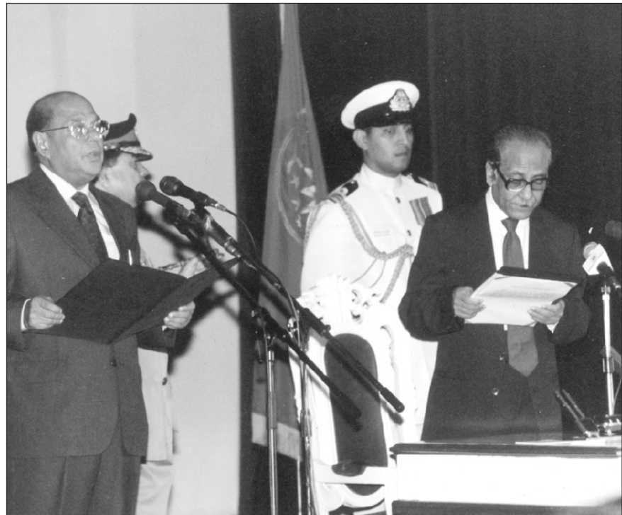
July: Chief Advisor of caretaker government took oath on the 15th.