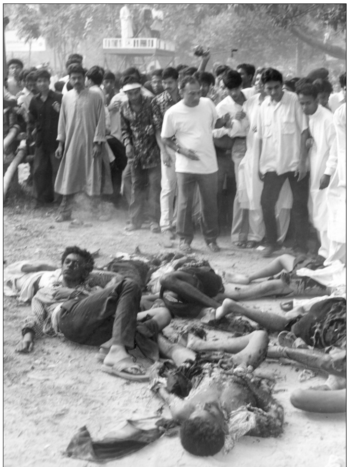
April: Bomb blast at Ramna Batamul Bengali New Year celebration congregation in Dhaka on the 14th killed ten.