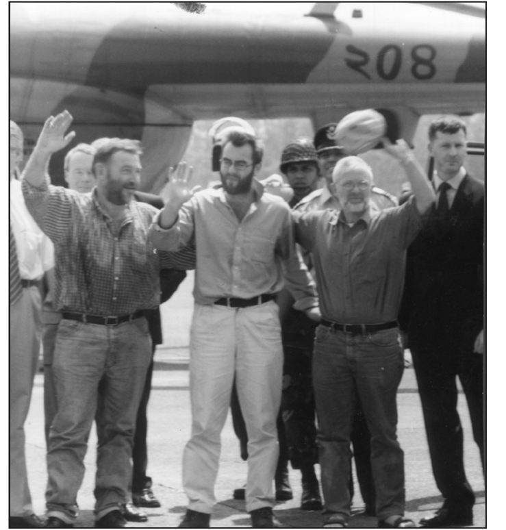
March: Three foreigners taken hostage by terrorist group in Chittagong Hill Tracts were released in Rangamati on the 17th.