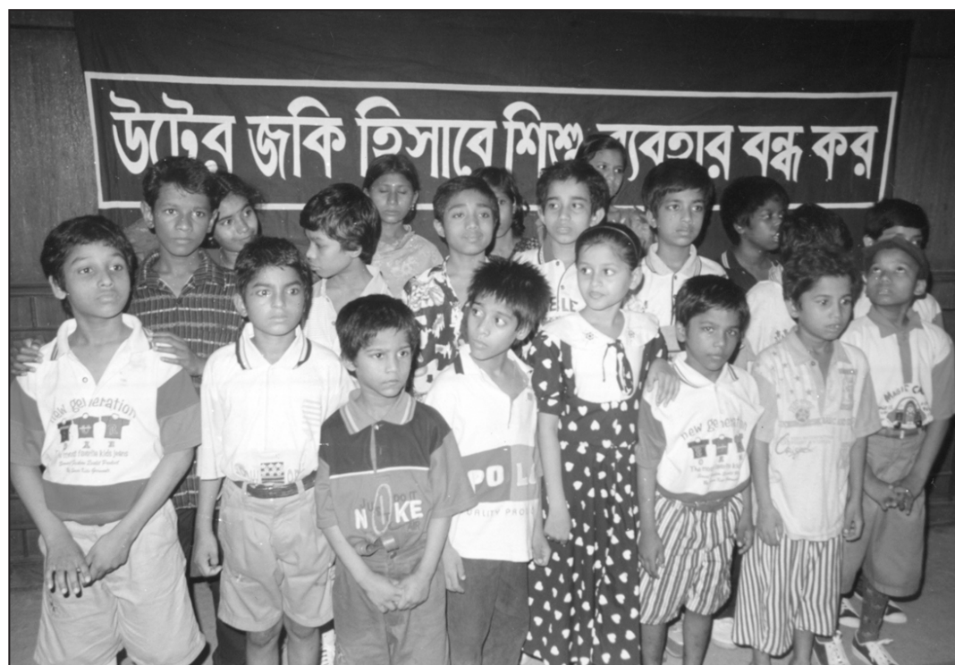
May: Rescued Bangladeshi children used as camel jockey in Middle East were brought to National Press Club on the 16th and a press conference was held in protest.