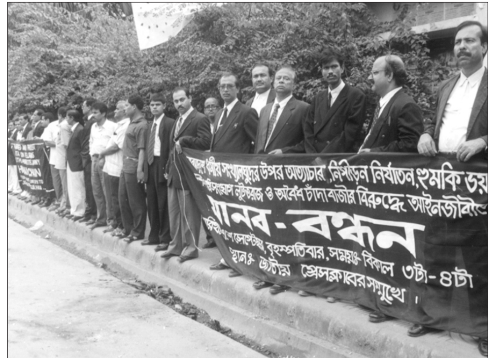
September: Lawyers form a human chain in front of National Press Club, Dhaka in a symbolic protest on the 29th against repression of minorities.