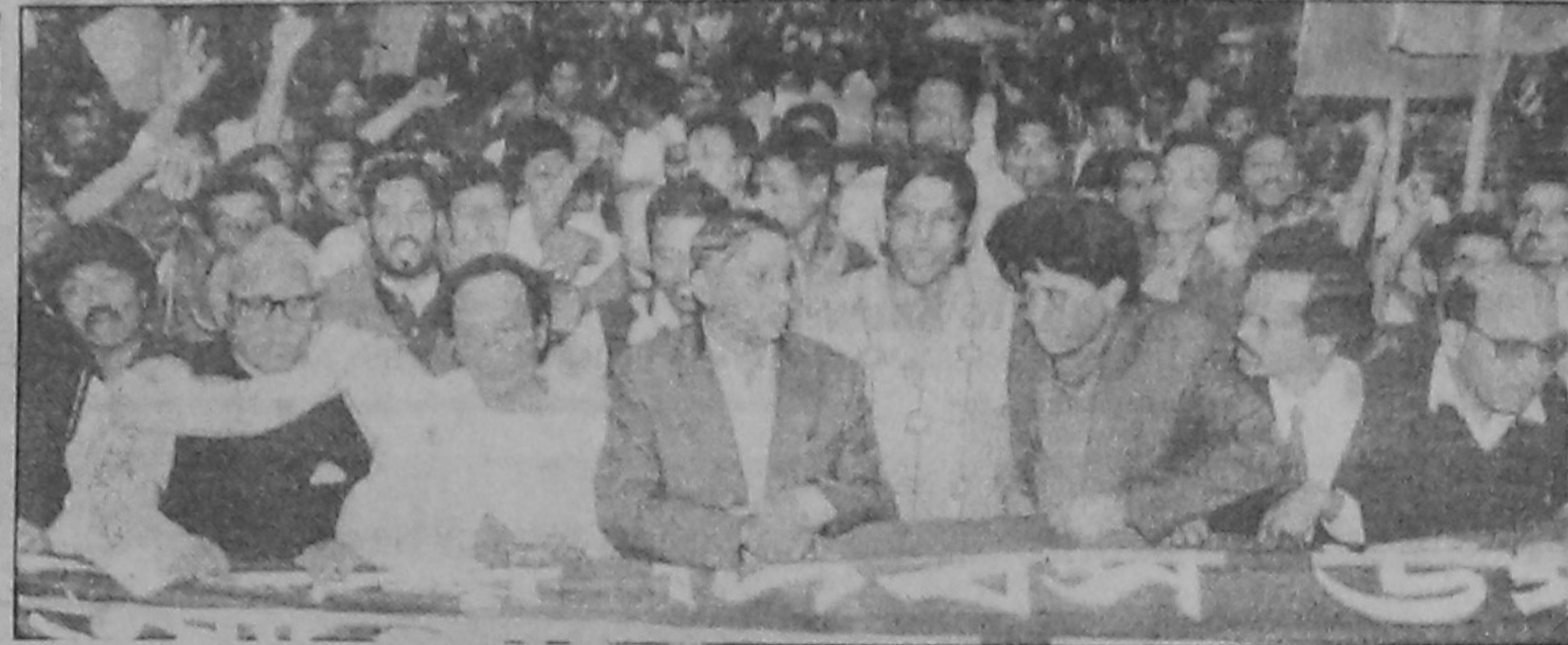
Awami League brought out a procession in the city yesterday protesting price hike of fuel, gas and electricity.

The Environment and Forest Minister sought cooperation of all concerned to stop use and marketing of polybags from today mentioning that the polybags caused a serious environmental degradation.