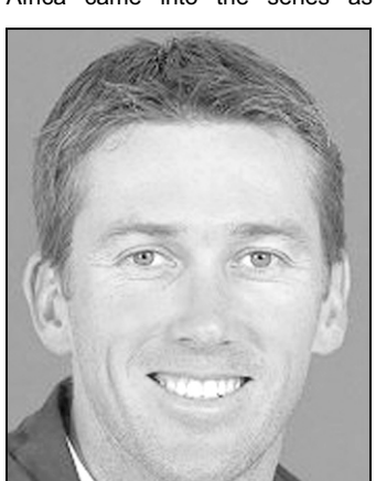
GLENN MCGRATH Australia's closest rivals but McGrath, who has taken 68 wickets from 14 Tests this year, said he

as the world's top side, won the second Test at Melbourne Cricket Ground by nine wickets on Saturday after also dominating the first. South Africa came into the series as