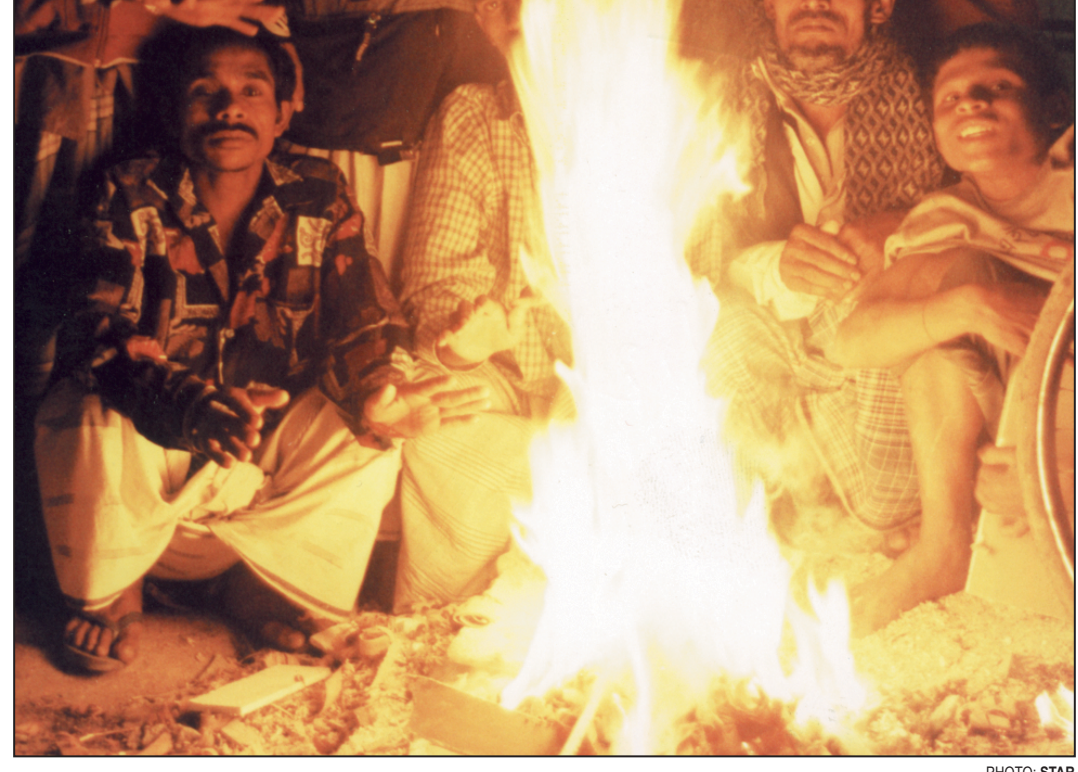
Poor people warm up around a fire place at winter night. Now a severe cold wave has been sweeping all over the country. Intensity of cold is much higher in five districts of greater Rangpur where the affected people are yet to receive rags and other warm clothes from government and non-governmental organisations.

Rangpur. There are further informations that cold wave will be intensified from early January and is likely to continue upto February next. This forecast has created a panic among the people of the area