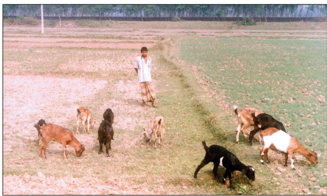
A cattleboy grazing domestic animals at a field at village Sastibar in Jhenidah where grazing grounds are shrinking very fast. Cattle resources are decreasing due to this phenomenon.

The project components include protection work on the riverbank, loop cutting at various points of the river and construction of a water regulation structure.