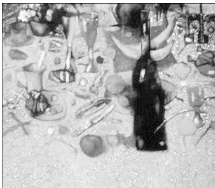
Funny still-life / Oil, 70x70 cm, 2001 (Solomkin Yuriy from Russian Federation)

Paintings in oil, acrylic and mixed media would bring some