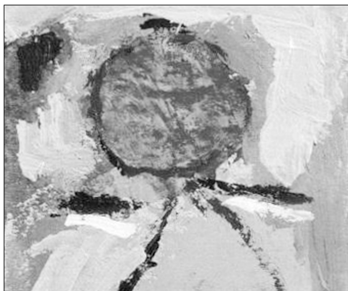
Without Title no. 10 / Acrylic, 17 / 11.5, 1999 (Bouchta El Hayani from Morocco)