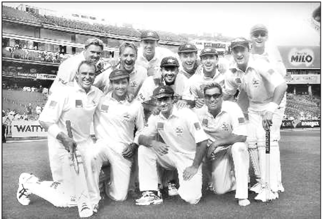
THE CONQUERORS: Victorious Australia cricket team members pose for a photograph after defeating South Africa in the second Test at Melbourne on Saturday.