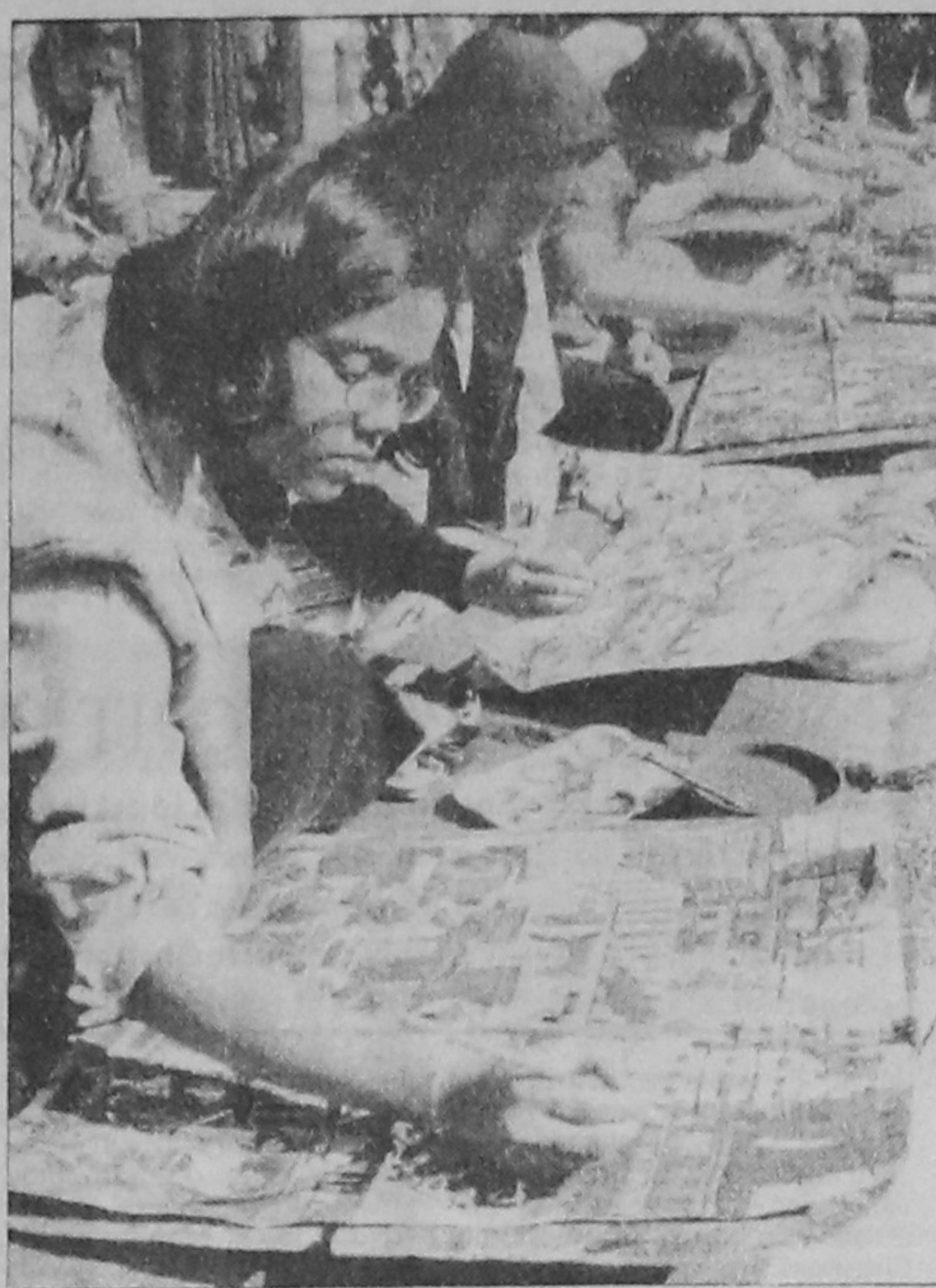
Children take part in a drawing competition on the Kachi-Kanchar Mela premises in the city yesterday. The Central Kachi-Kanchar Mela organised the contest to mark the birth anniversary of Shilpacharya Zainul Abedin.

He criticised the immediate-past Awami League government for not checking terrorism and said for that reason people staged a silent revolution in October 1 elections by giving an overwhelming mandate to the four-party alliance.