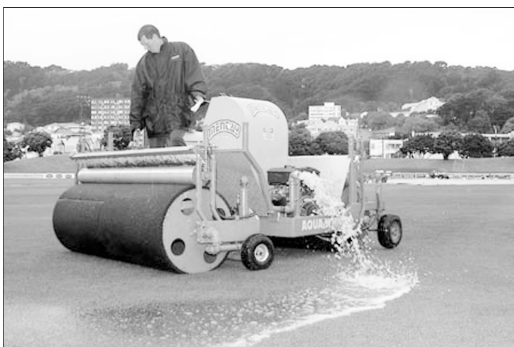
A groundstaff at the Basin Reserve in Wellington drains water from a super-sopper on the second day of the second Test between Bangladesh and New Zealand on Thursday.