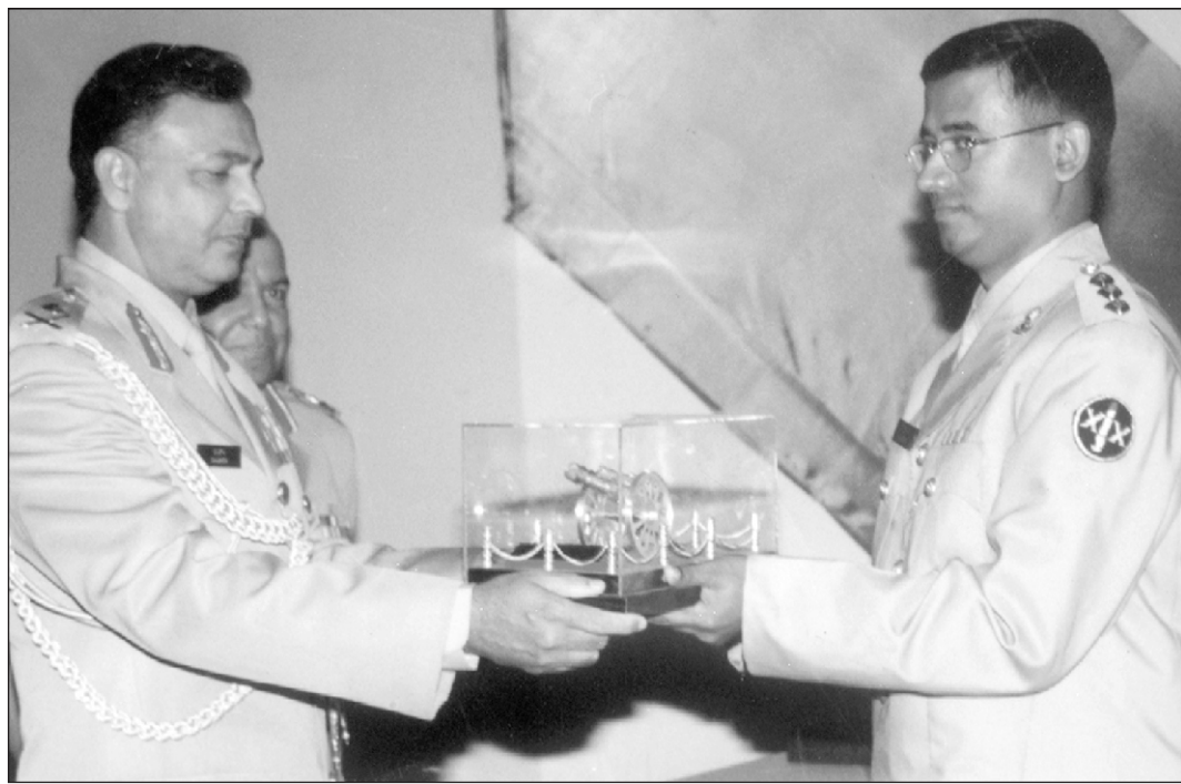
Chief of Army Staff Lieutenant General M Harun-Ar-Rashid, Bir Protik handing over the trophy to the best all-round student-officer on the occasion of the Certificate Awarding Ceremony of the Officers' Gunnery Staff Course at the Artillery Centre and School, Halishahar, Chittagong on Wednesday.

Meanwhile, the Sundarbans East Zone has fixed a target to collect Tk 2.5 crore in revenue in the current fiscal.