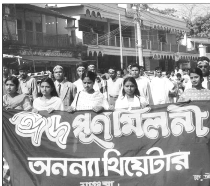
Members of Ananya Theatre, a cultural organisation, parade the streets of Magura town in a colourful procession on the occasion of Eid Reunion recently.