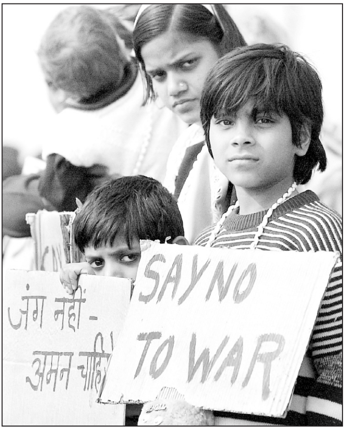
Activists from People for Peace holds placards during a peace march against war at New Delhi's India Gate on Tuesday.

Afghanistan's defence ministry has begun laying the foundations of a national army -- a task that involves integrating tens of thousands of fighters from the ranks of ethnic warlords throughout the country, officials said Tuesday.