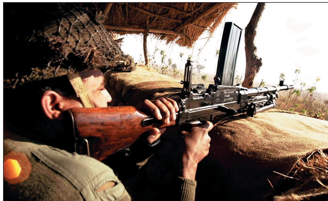
A member of the Indian Border Security Force (BSF) fires at Pakistani positions from Pallanwalla sector, 85 kms west of Jammu, near the Line of Control (LOC) separating Indian and Pakistan held Kashmir yesterday.