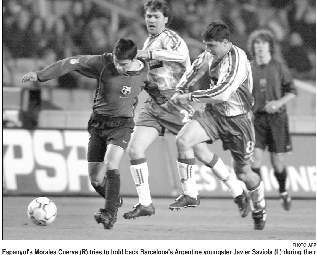
Primera Liga clash at Barcelona on December 22.