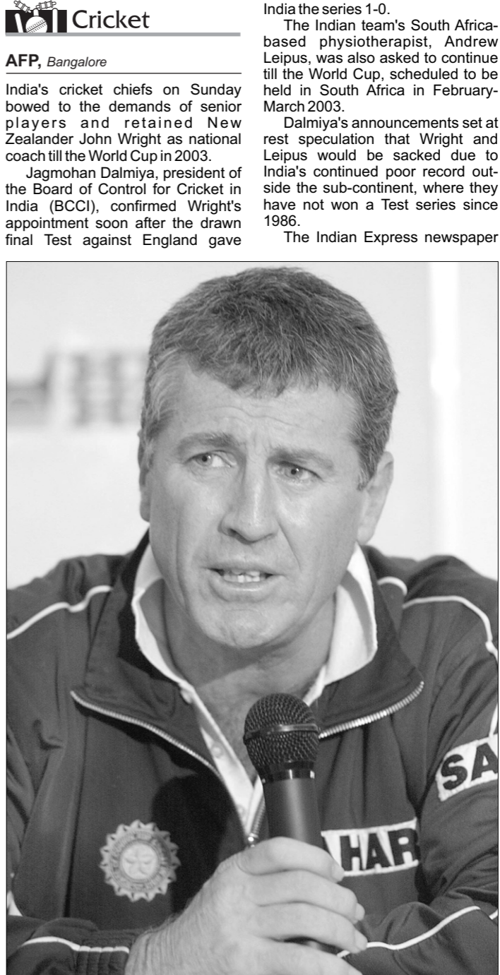
India coach John Wright speaks to reporters in Bangalore on December 23. The New Zealander was retained as India coach earlier in the day.