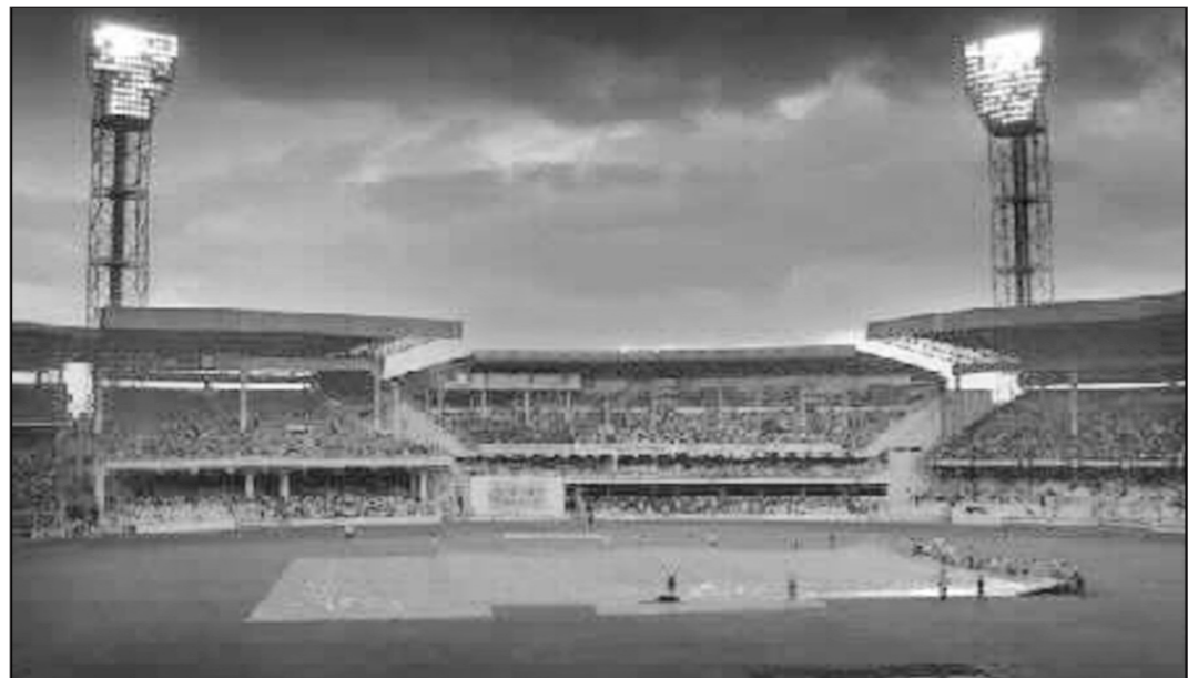
Dark clouds hang over the Chinnaswamy Stadium in Bangalore on Sunday morning.

England were in command when rain also forced play to be called off early on Saturday. The tourists were 33 for no wicket in their second innings, a lead of 131 runs.