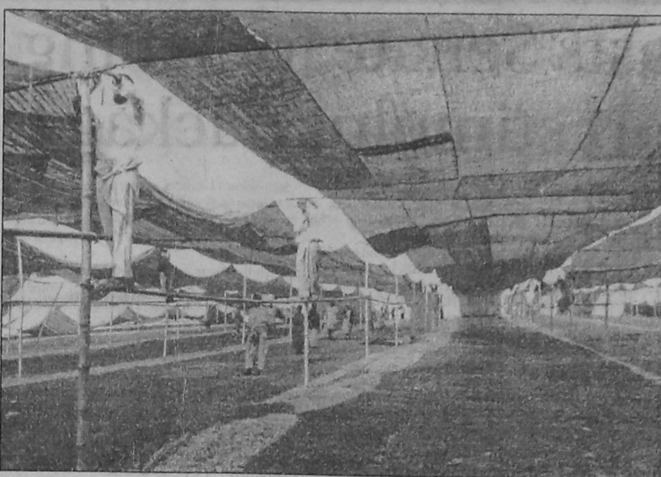
Preparations for Bishwa Jtama are going on in full swing. The three-day event will begin on the bank of the river Turag in Tongl on January 19.