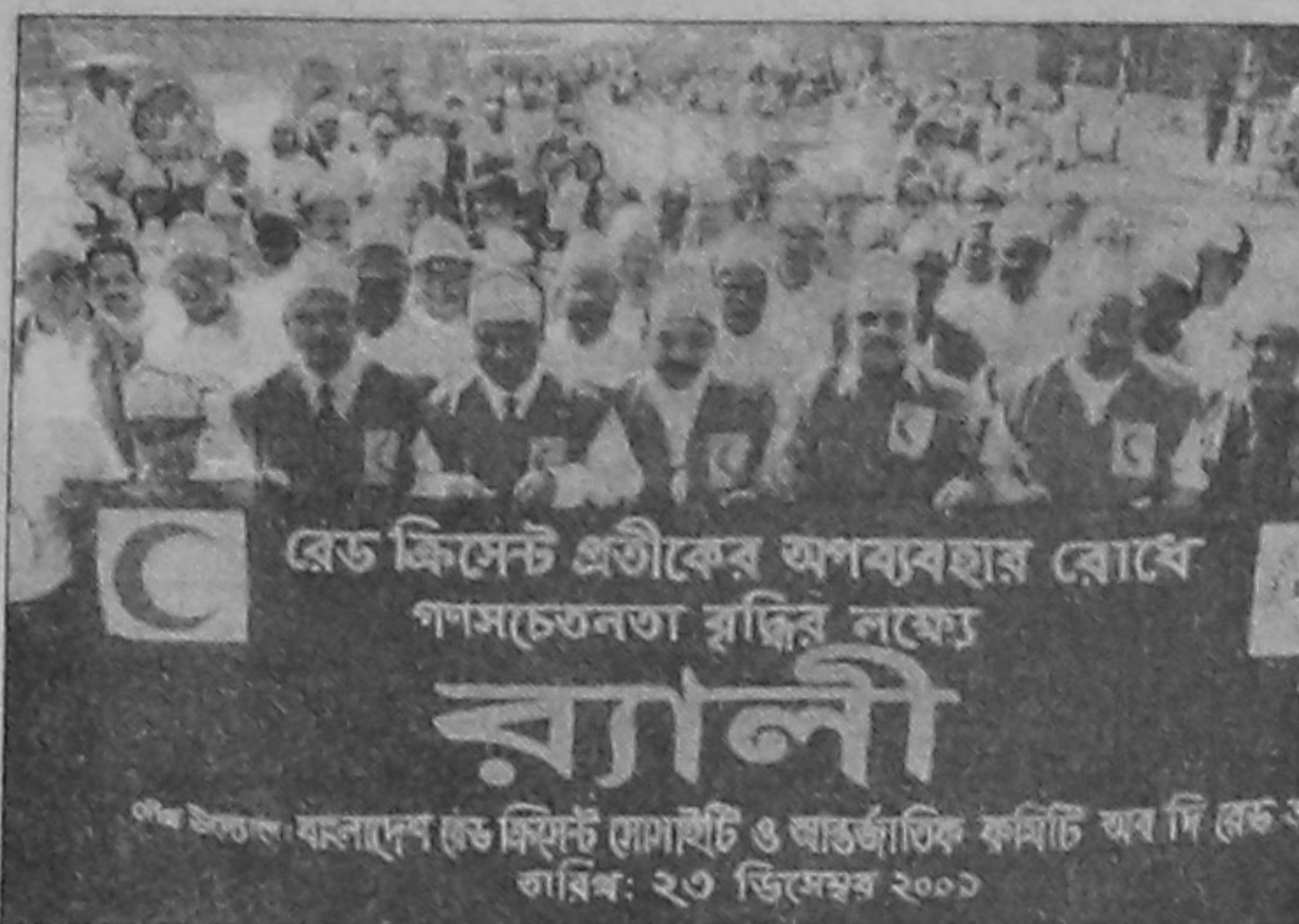
Bangladesh Red Crescent Society yesterday brought out a procession in the city yesterday to create awareness among people about misuse of the BDRCS logo by some miscreants across the country.