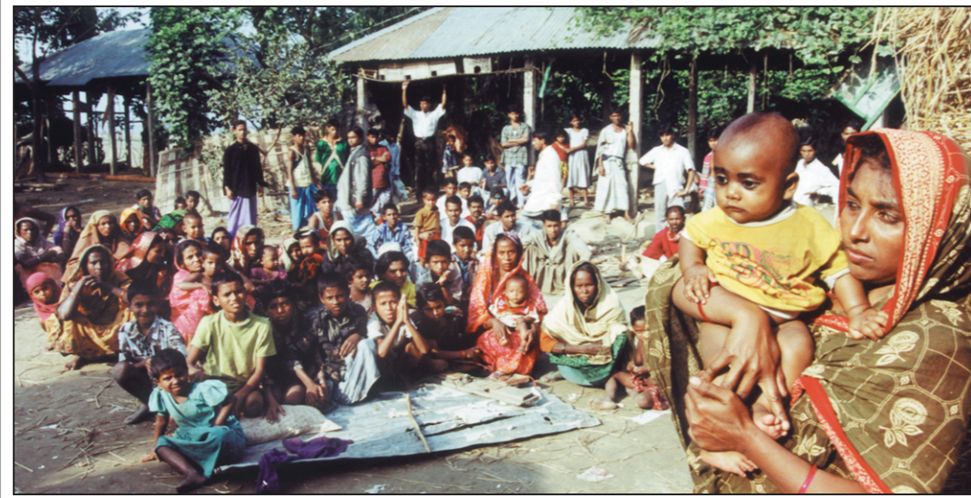
Affected families under open sky at village Aguandi in Arahazar upazila as their houses were damaged by armed terrorists allegedly led by BNP men on Friday. At least 35 houses were damaged in the attack.