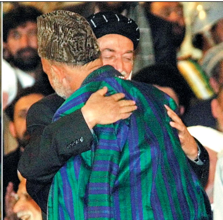
Hamid Karzai taking oath as Prime Minister of the new Afghan interim government in Kabul yesterday. (Right) Karzai (back to camera) is congratulated by former President Burhanuddin Rabbani after the oath-taking.