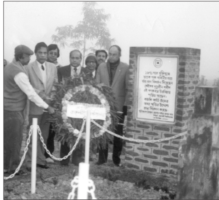
The vice chancellor of Rajshahi University (RU) places wreaths at the monument of a mass grave on the campus on the occasion of Victory Day on December 16. The pro-vice chancellor and the registrar of the university are also seen.

It is to be mentioned here that none of the vice chancellors of IU could complete so far their term due to immense pressure by the political parties.