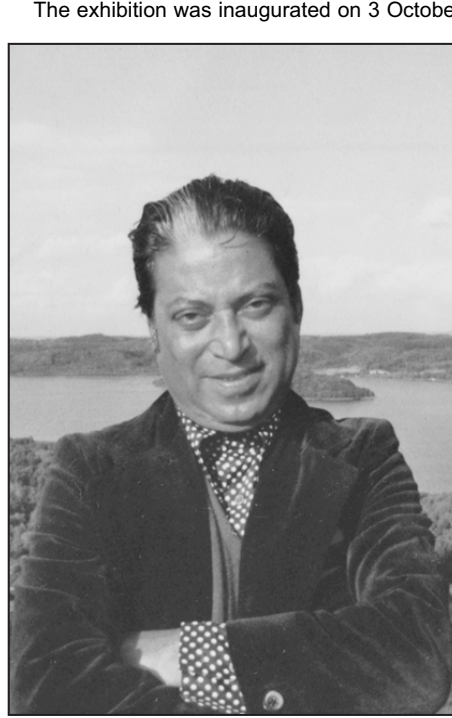
The author in his Brasilian sojourn

would soon be meeting me next day. The exhibition was inaugurated on 3 October