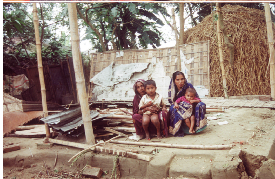
A housewife at village Aguandi in Arahazar upazila wail after armed terrorists allegedly led by BNP men ransacked and looted their house (top) and two other women sit on their empty homestead as the house was completely damaged in the attack yesterday.