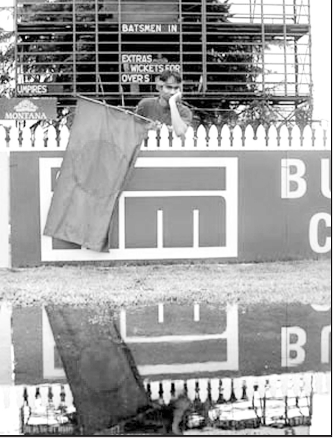
JUST LIKE HOME ! A disappointed Bangladeshi expatriate fan looks at the flooded ground at Hamilton on December 19.

Because the hours of play will be extended if play was to start at 11.30am and continue through until the scheduled finish on Saturday evening, 315 overs minimum, representing 105 overs a day, would be available to contest the match