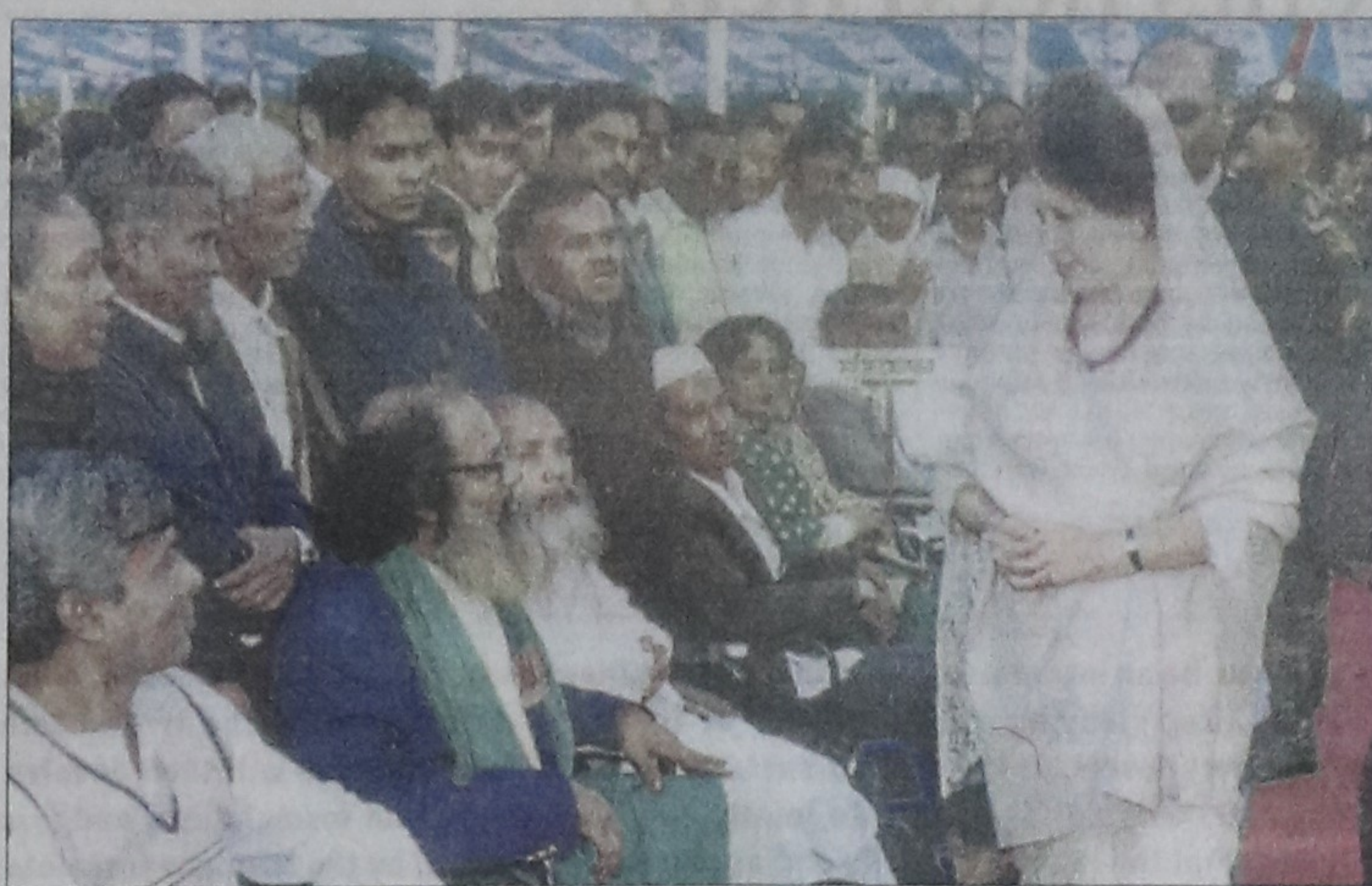
Prime Minister Khaleda Zia exchanges greetings with the disabled freedom fighters at a reception marking the Victory Day at Bangabhaban on Sunday.

Announcing the increase in pension, State Minister for Freedom Fighters Affairs Redwan Ahmed said the successors of the Bir Shresthas will also be provided with employment.