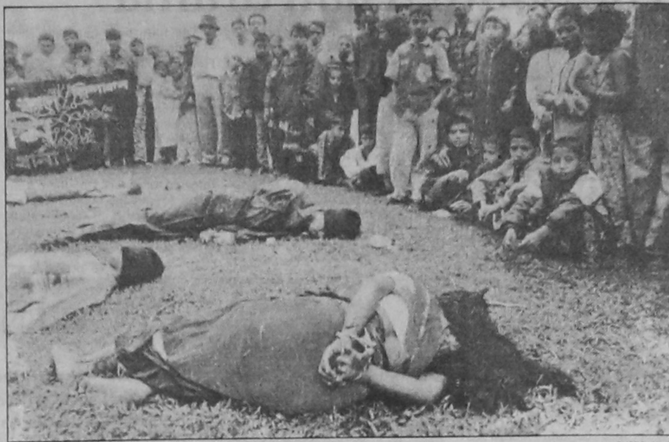
Performers of a local cultural organisation enact a drama sequence portraying the heinous killing of intellectuals during the Liberation War in 1971 at the Martyred Intellectuals Memorial at Mirpur yesterday.

He called for a collective effort to eliminate all kinds of terrorism. The Bangladesh speaker urged his counterpart to face the situation with courage.