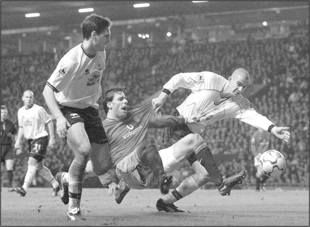
Ruud van Nistelrooy (C), Manchester United's Dutch international striker in sandwiched between two Derby defenders at Old Trafford on Wednesday.

The England hitman had half a dozen clear-cut openings to reach a ton but had one of those rare nights when it just would not run for him