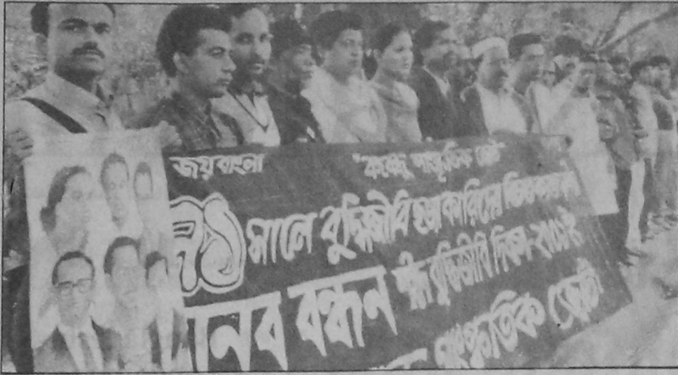
Bangabandhu Sangkritik Jote formed a human chain in front of the National Press Club yesterday demanding trial of the killers of intellectuals who were martyred in 1971.