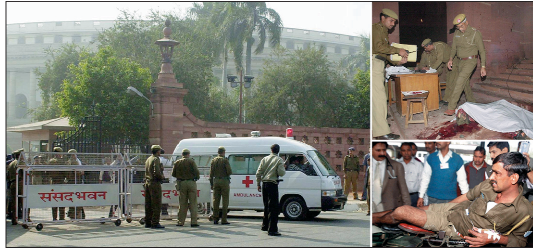
Ambulances (L) leave the parliament building compound in New Delhi as more arrive after the attack yesterday. Police stand over the body of dead militant (Top R) while an injured policeman is being taken to hospital (Bottom R).