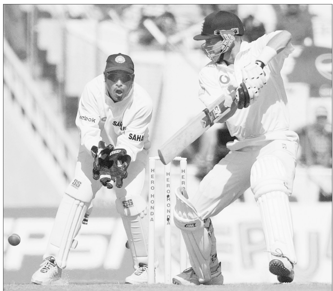
England's Craig White plays a cut-shot on way to scoring his maiden century on the second day of the second Test against India in Ahmedabad on Wednesday.