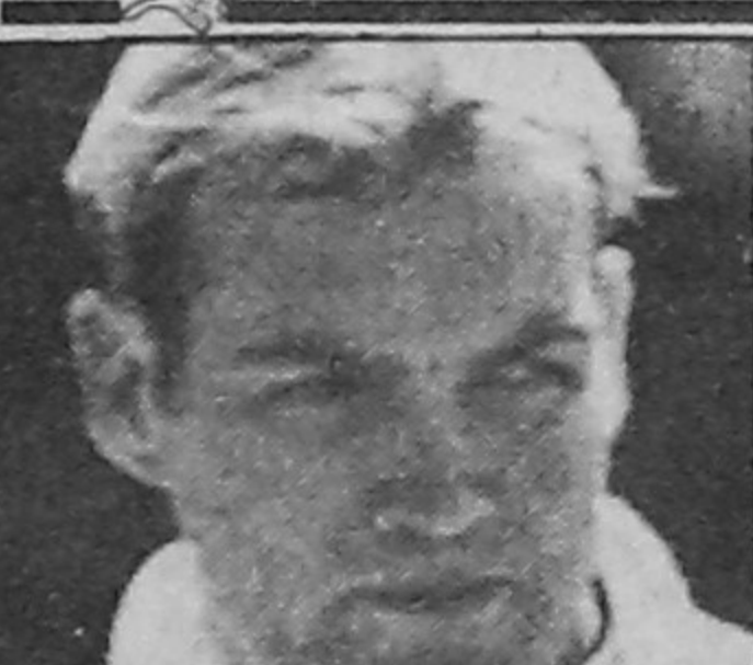
Jacques Kallis (South African star cricketer) "For us, this is our biggest clash. We see it as one and two playing each other for the world Test crown." On the forthcoming Test series against Australia.