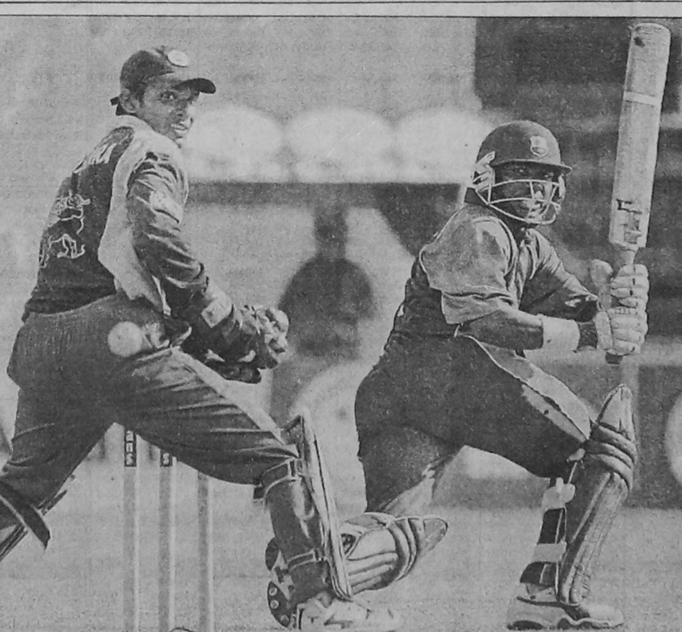
West Indies starbat Brian Lara sweeps fine during their triangular series match against Sri Lanka in Colombo on December 11.

Brazilian international Zago, 32, joined Roma from Sao Paulo club Corinthians in 1997.