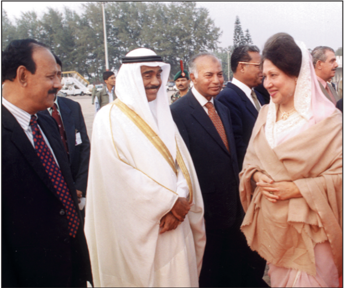
Ministers and top officials of the government and the Saudi Arabian Embassy saw off Prime Minister Khaleda Zia at the Zia International Airport prior to her departure for Saudi Arabia yesterday.