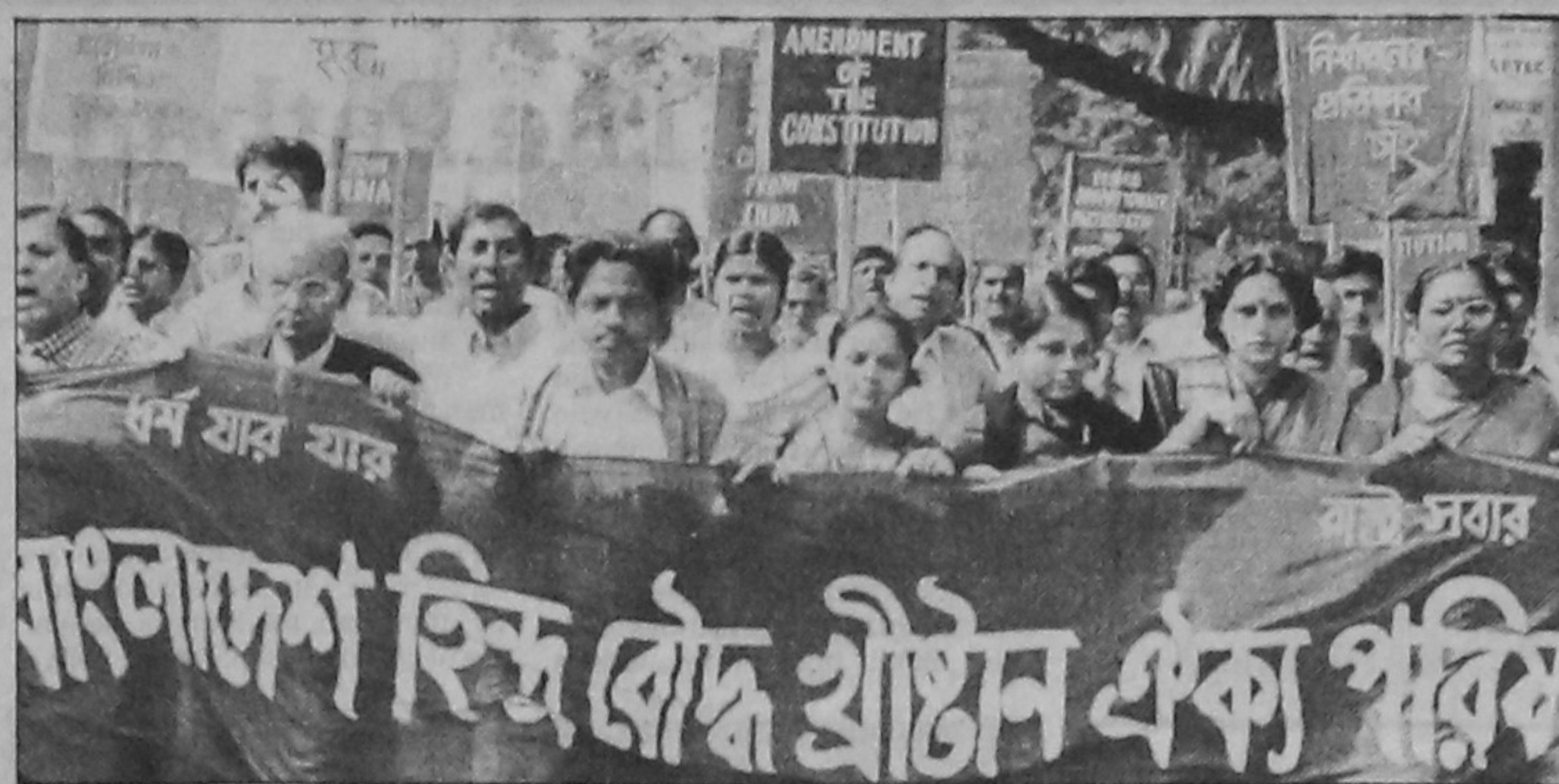
Bangladesh Hindu Bouddha Christian Oikya Parishad staged a demonstration in the city yesterday protesting attacks on the religious minorities across the country.