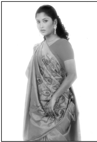
Turquoise blue silk saree

In the salwar kameez range, georgette 3-pc ensembles have been given a new look with work with sequins and combinations of painting and block prints. The