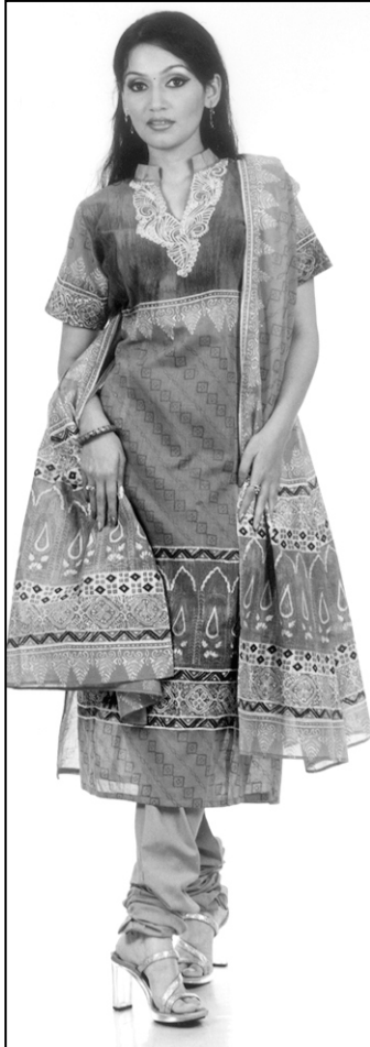
Purple and blue 3-piece ensemble

salwar kameez range are all in bright and happy colours, with a touch of somberness to even out the effect of heat. Most are swathed in happy colours of pastel shades and have been block-printed and embroidered on.