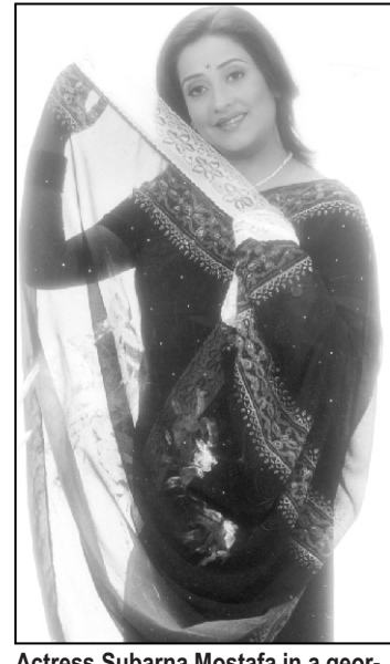
Actress Subarna Mostafa in a georgette saree from the boutique