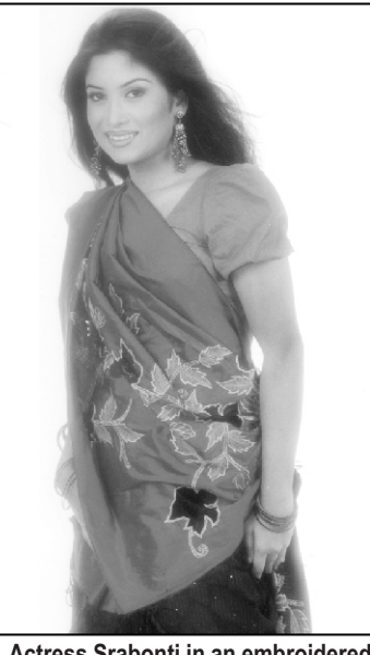
Actress Srabonti in an embroidered red and black silk saree