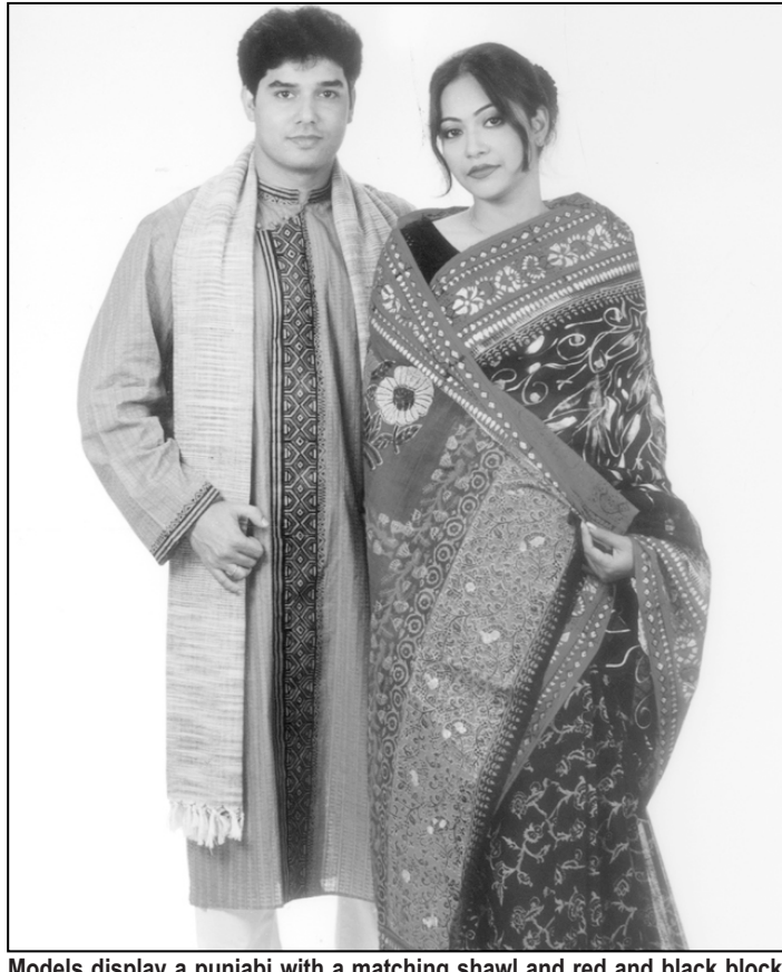
Models display a punjabi with a matching shawl and red and black block printed saree in cotton

till Eid day at the show room of Henry's Heritage at Dhanmondi's Road number 27 (old) 16 (new).