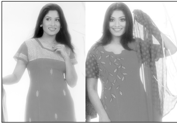
A red salwar kameez in sequins A black and red georgette kameez

till Eid day at the show room of Henry's Heritage at Dhanmondi's Road number 27 (old) 16 (new).