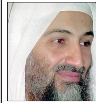
OSAMA BIN LADEN