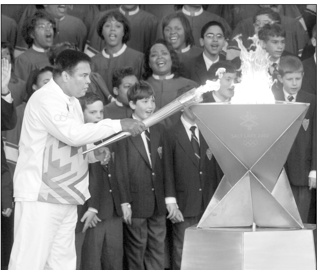
Boxing legend Muhammad Ali lights the torch for the Salt Lake 2002 Olympics at Centennial Olympic Park in Atlanta on December 4.

Her success in securing a letter of backing from the French Football Federation has also increased attention on French attitudes.