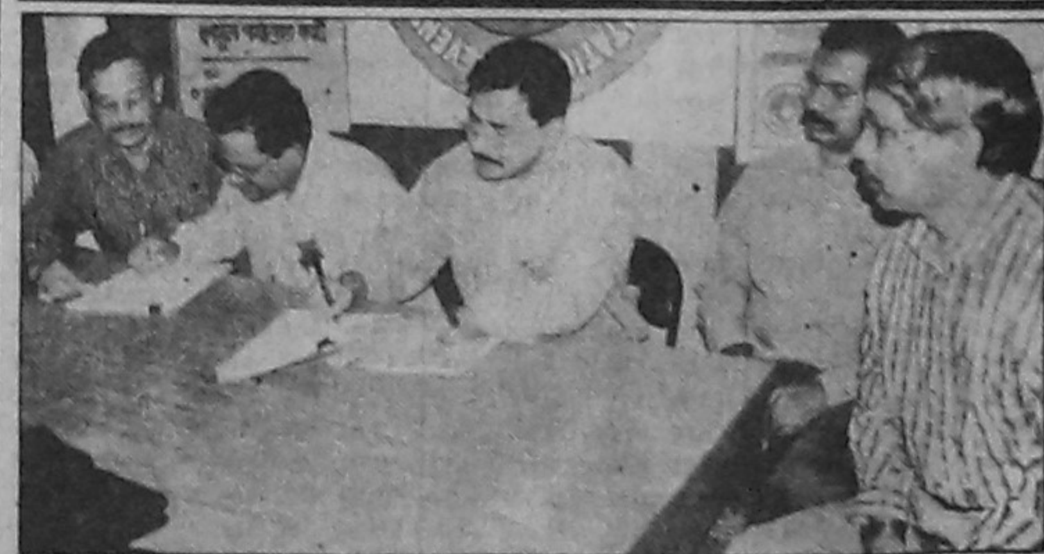
Bangladesh Centre for Communication Programmes (BCCP) signed a MOU with Red Barnet, Bangladesh recently.

Bangladesh Garments Sramajibi Natya Sampradaya will hold a discussion and an iftar party to mark its 6th founding anniversary. Venue: Mirza Abbas Mohila Degree College, South Shahjahanpur, Railway Colony. Time: 3.00pm.